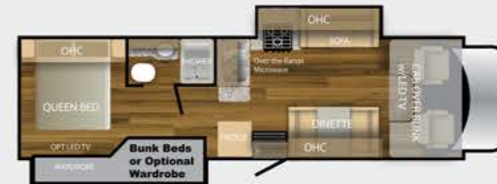
PHANTOM 32P | SLEEPS 8-10