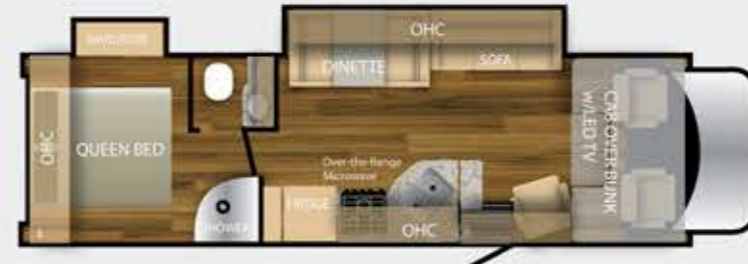
PHANTOM 31P | SLEEPS 6-8