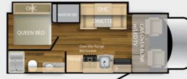
PHANTOM 25P | SLEEPS 5-6