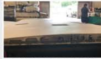
ONE PIECE WRAPPED FIBERGLASS ROOF NO SEAMS FROM FASTENERS ON ROOF