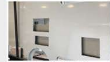
TALON GEL COAT GLASS FUSED FIBERGLASS WITH COMPOSITE BACKER