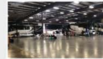
FULL CAMPING SIMULATION YOUR UNIT IS WORKING BEFORE THE DEALER RECEIVES IT