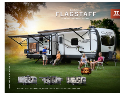
FLAGSTAFF TRAVEL TRAILERS