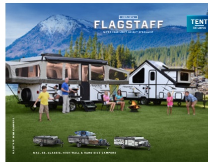
FLAGSTAFF TENT CAMPERS

Look for our other popular lines of Flagstaff camping trailers.