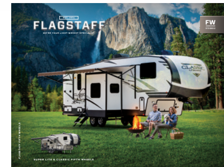
FLAGSTAFF FIFTH WHEELS

FREE MEMBERSHIP to Forest River Owners' Group