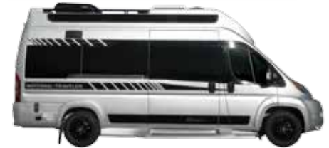
The Only Raised Roof in its Class DLX With Sport and Paint