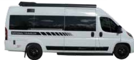
Optional Sport Graphics (No Charge)