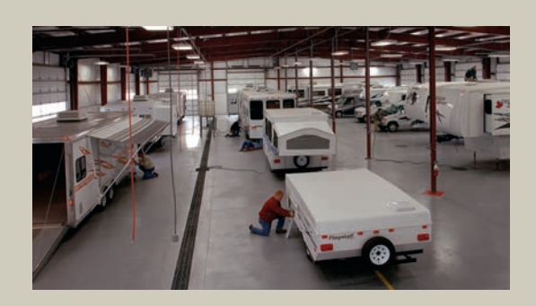
20,000 square feet of quality assurance. The bare essentials for a premium product. This state-of-the-art facility gives immediate daily feedback to production for quality assurance in every unit built.

GVWR (Gross Vehicle Weight Rating) - is the maximum permissible weight of the unit when fully loaded. It includes all weights, inclusive of all fluids, cargo, optional equipment and accessories. For safety and product performance do NOT exceed the GVWR.