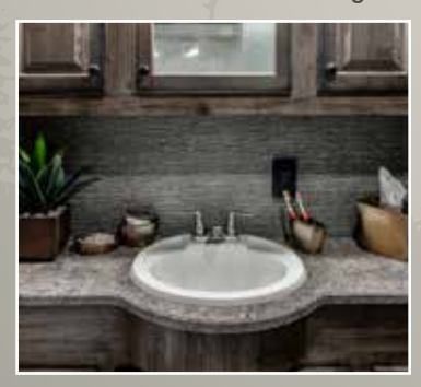
Full Size Vanity Sink