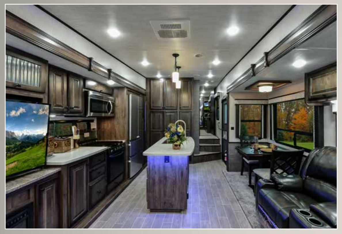
Bighorn Traveler 32RS shown in Burlington Decor