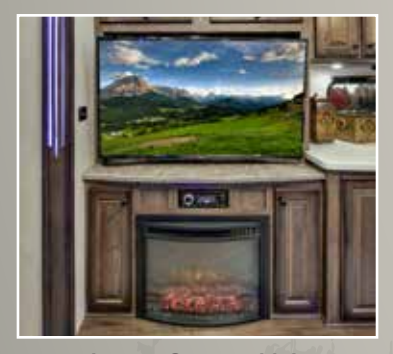
Entertainment Center with Large LED and 5100 BTU Fireplace