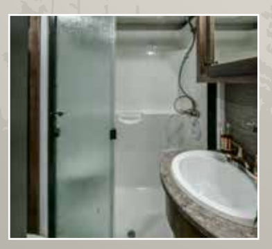
Shower with Rain Glass Shower Door