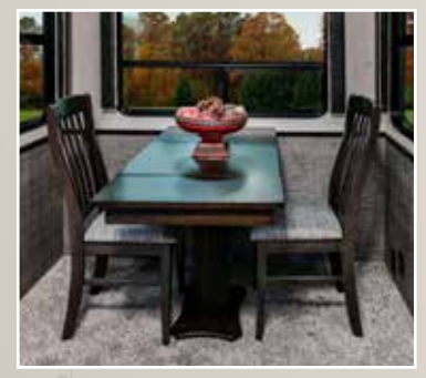
Dinette Table with Leaf Extension