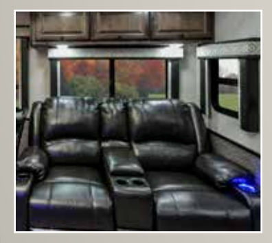
Power Theater Seat with Center Console with Heat and Massage