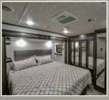
King Bed Standard in Master Suite