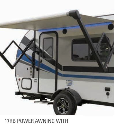
MULTI-COLORED LED LIGHTS