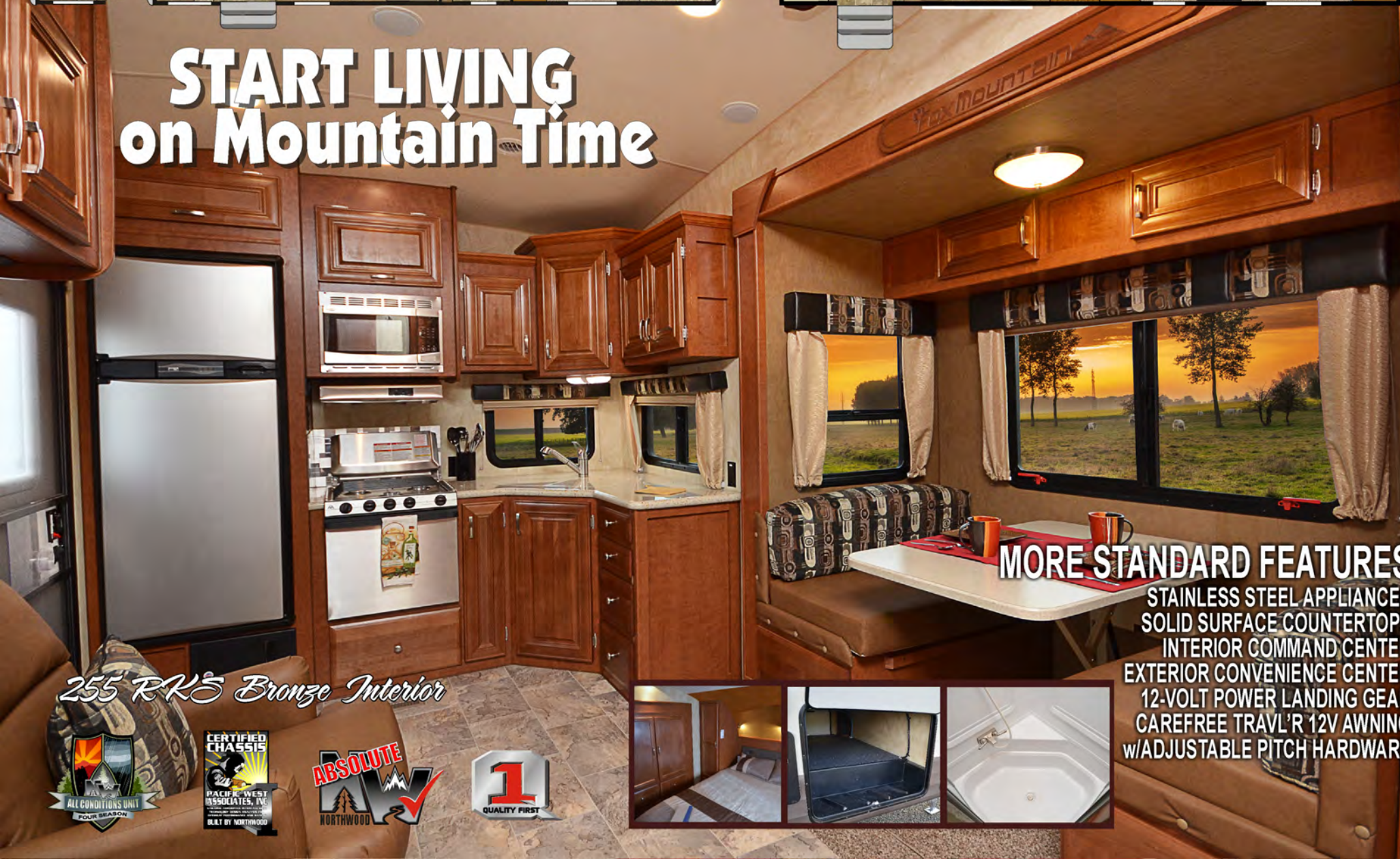
255 RKS Bronze Interior