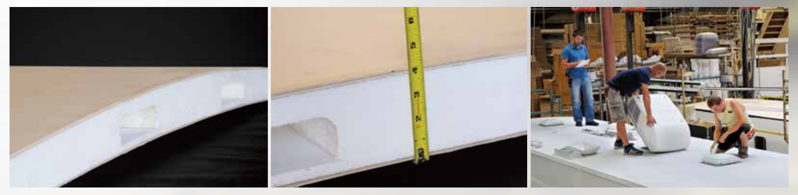
Vacuum-bonded radius roof with vaulted ceiling providing Ultraior insulation and more interior height.