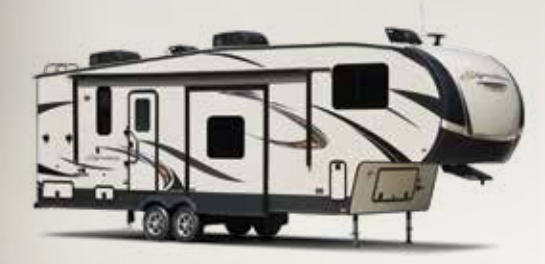
STANDARD CHAMPAGNE EXTERIOR