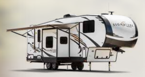
OPTIONAL WHITE EXTERIOR

designed our fifth wheels with the best in style and amenities while keeping your towing needs in mind. Quality craftsmanship and attention to detail have been put into our Signature fifth wheels, all with you in mind. Our fully equipped kitchens with modern conveniences and spacious bedrooms featuring residential queen bedslideouts will make you feel like you never left home.