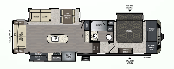
Rear living room, triple-slide, king bed Weight: 10460 LBS. | Length: 34'11" 310RS