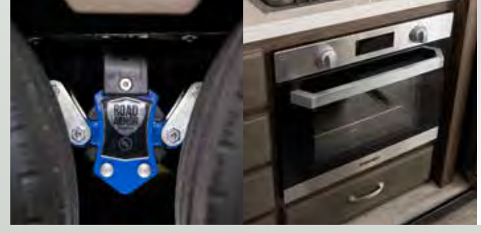
EXCLUSIVE Road Armor™ suspension Equalizes axle load to dampen shock and vibration