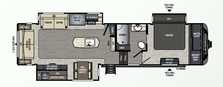
Rear living, triple-slide, outside kitchen Weight: 10990 LBS. | Length: 36' 9"