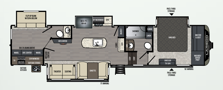
1-1/2 bath, bunkhouse, outside kitchen 367BH Weight: 12191 LBS. | Length: 39' 3"