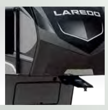
Automotive-grade painted caps KeyGuard™ chip and rock protection