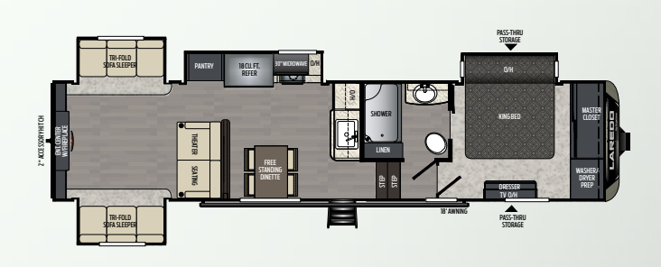
342RD Rear den, four slides Weight: 11185 LBS. | Length: 37'10"