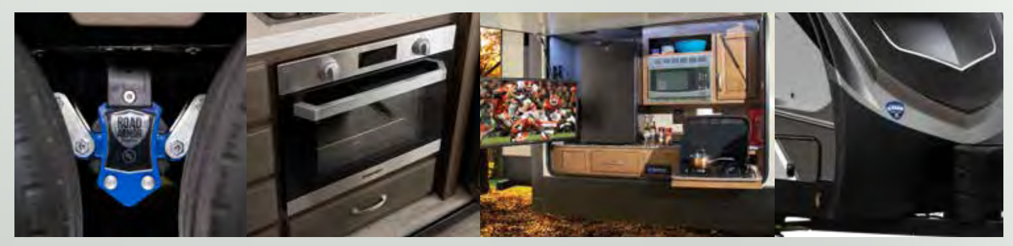
EXCLUSIVE Road Armor™ suspension Equalizes axle load to dAMPen shock and vibration