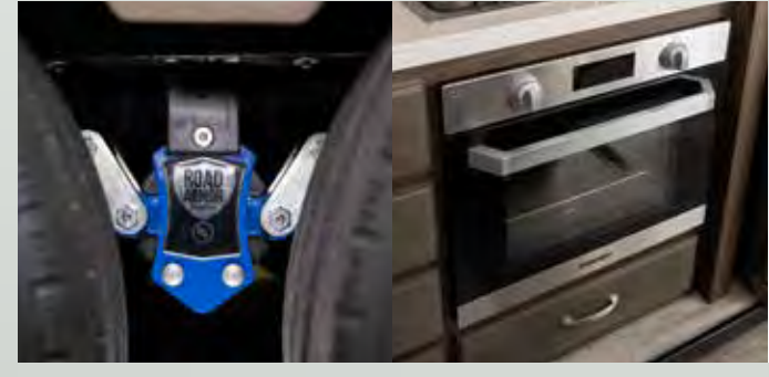
EXCLUSIVE Road Armor™ suspension Equalizes axle load to dampen shock and vibration