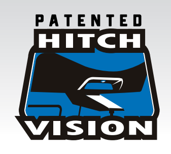
EXCLUSIVE HitchVision™ Simplifies hitch hook-up with "no looking back" convenience