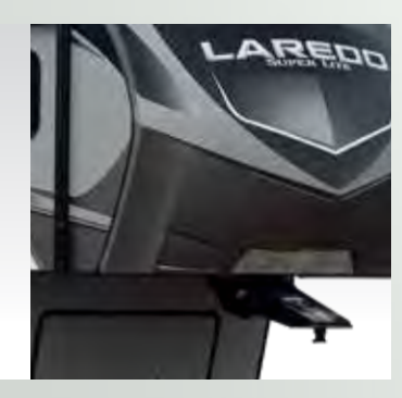
Automotive-grade painted caps KeyGuard™ chip and rock protection