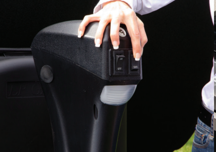
Power tongue jack

Making it fast and easy to setup your campsite