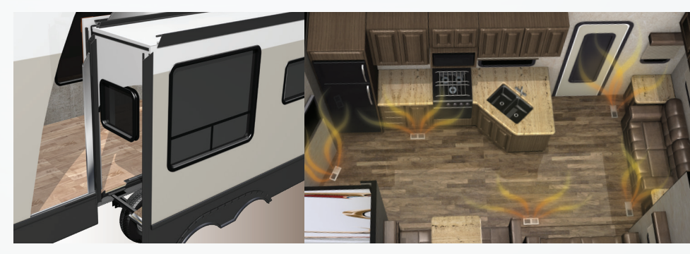
EXCLUSIVE Tru-fit™ slide construction

A more durable slide room design that minimizes functional motor and structural stress, resists leaking