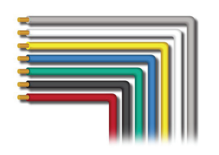
EXCLUSIVE color-coded wiring

Distributes heat evenly for greater comfort