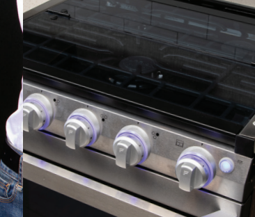
New Furrion® glass cooktop

Making it fast and easy to setup your campsite