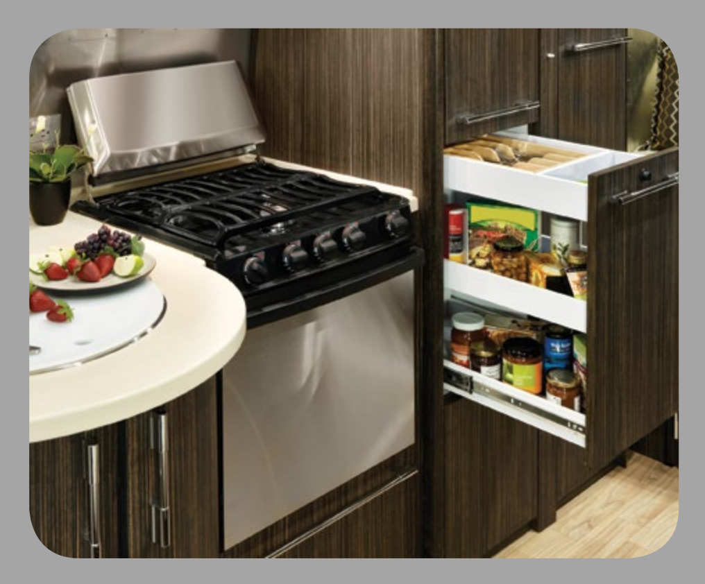
Tasteful travel: 3-burner range, Dupont Corian® countertop and plenty of pantry space makes for some great meals.

What truly sets the Signature apart is what's on the inside. Each of the floorplans is loaded with features as durable as they are beautiful – solid wood, stainless steel, Grohe faucets and premium hardware.