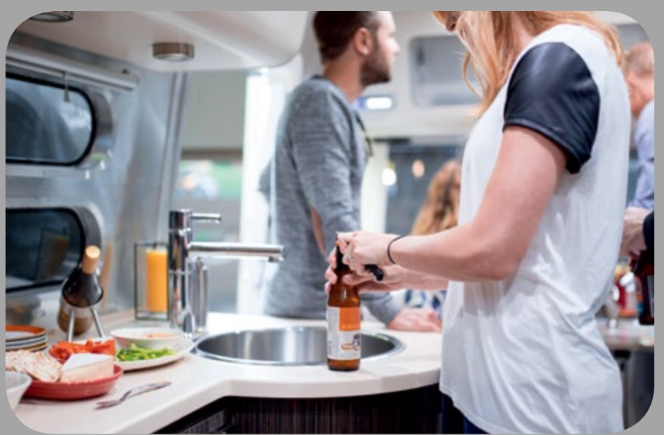
Space to soirée.