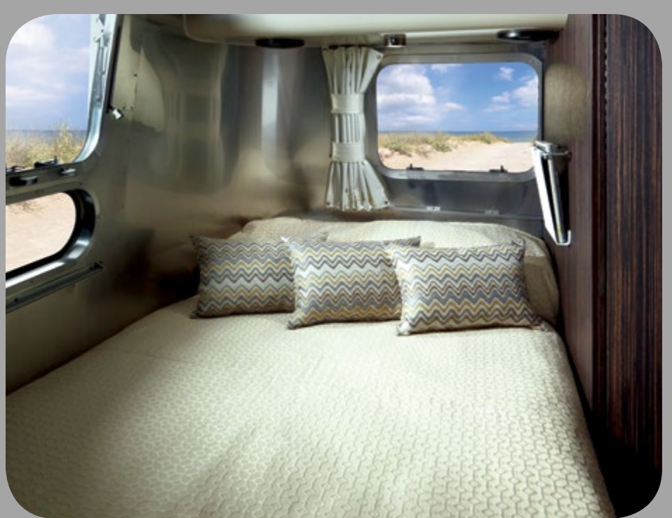
Where sleek meets sleep.