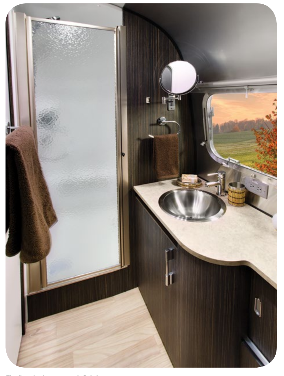
Finally, a bathroom worth fighting over.