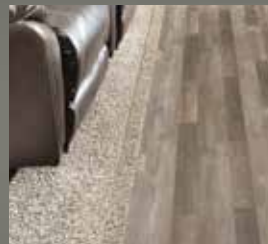
Shaw® Carpet and Linoleum