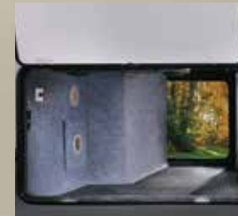
100" Wide Body with Drop Frame Chassis