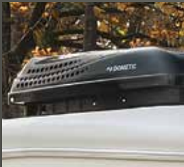
15K BTU Whisper Quiet A/C