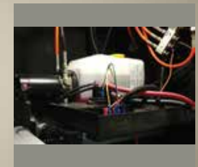
Hydraulic Slide and Jack System