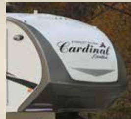
Painted Gel Coat Fiberglass Front Cap