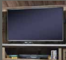
40" TV and Soundbar with Bluetooth and DVD Player