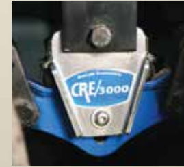
MORryde® CRE 3000 Suspension with 7,000 lb. Dexter® Axles