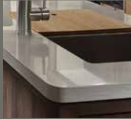
LG® Solid Surface Kitchen Countertops