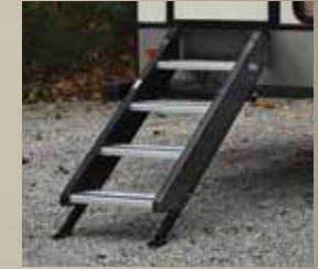
MORryde® StepAbove Entry Steps