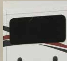
Hehr® Frameless Windows