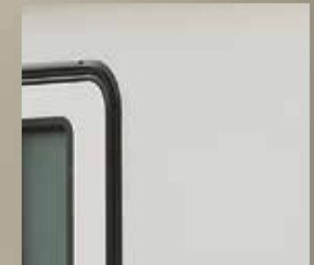
Oyster High Gloss Gel Coat Fiberglass