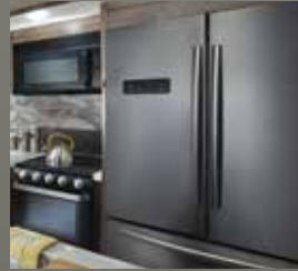
20.3 cu. ft. Residential Refrigerator