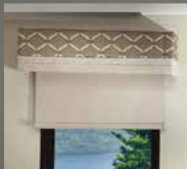
Roller Shades Throughout