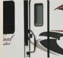
32" Entry Door with Friction Hinges