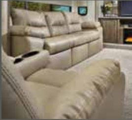
Residential 90" Sofa and Theater Seat