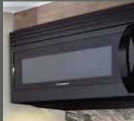
30" Convection Microwave Oven