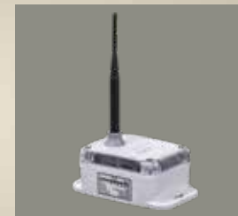
WiFi Ranger Signal Booster