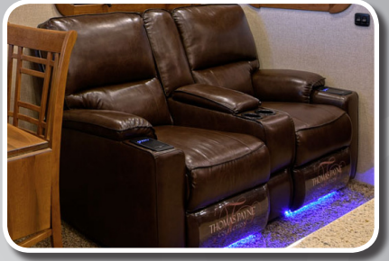
7 Function Tru-Sit Thomas Payne Massage