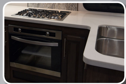
Gourmet Kitchen includes Stainless Steel Appliances, 50/50 Sinks, & a Pullout Faucet