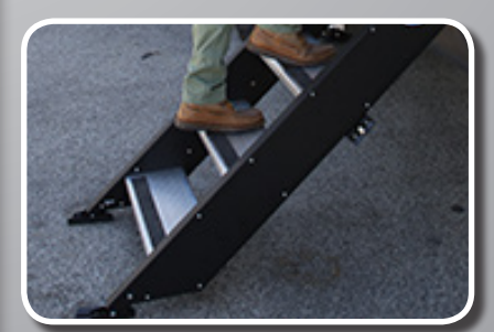
Solid Step Entry Steps