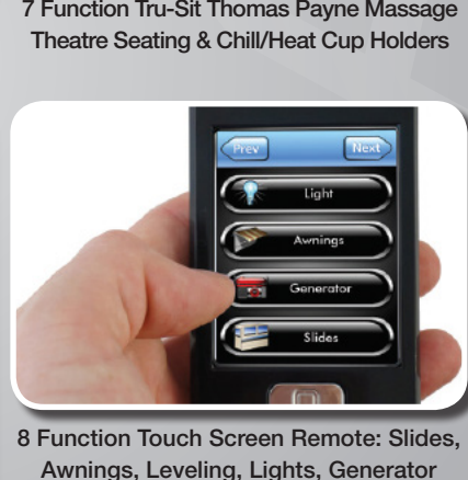
Awnings, Leveling, Lights, Generator