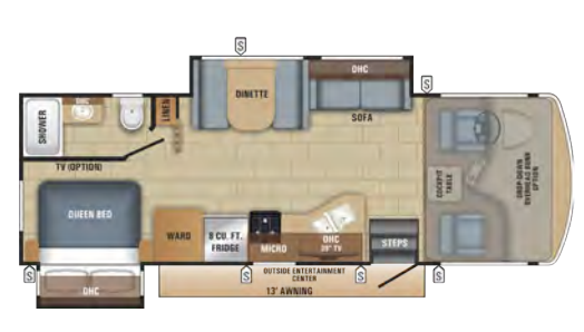
ALANTE | 26X