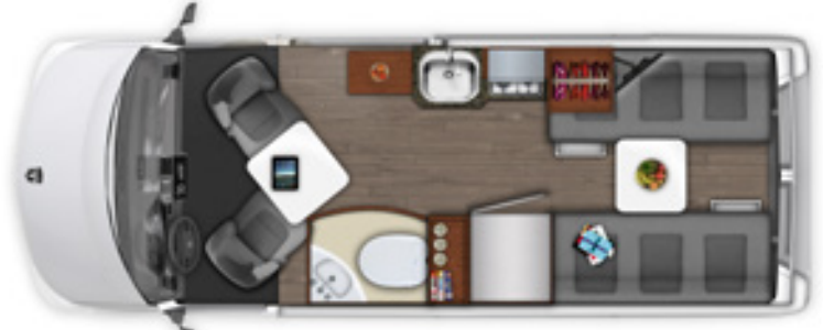
Interior floorplan of the Zion during the daytime

Take a step into your beautiful new Zion by Roadtrek. As you turn from your driver's seat, you'll find a pop-in table to enjoy a card game or a nice meal. Looking ahead to your kitchen, you'll be able to prepare a delicious meal on your 2-burner propane stove, and keep your groceries fresh in your 5 cu. ft. refrigerator. You'll have ample storage space in the kitchen including a pull-out pantry and a deep pot drawer. As you make your way through the galley, you'll find a comfortable and spacious permanent bathroom with stand-up shower, and finally arrive to your power composite leather sofa that converts into a king or two twin bed(s). End your day relaxed; watching your favorite movie on the 24" flat screen HD television.