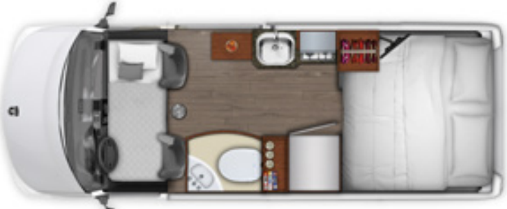
Interior floorplan of the Zion during the evening