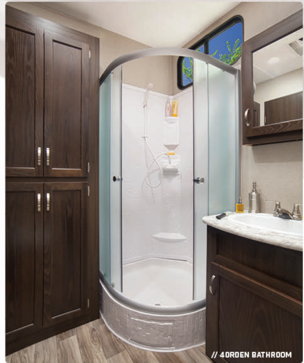
// 40RDEN BATHROOM