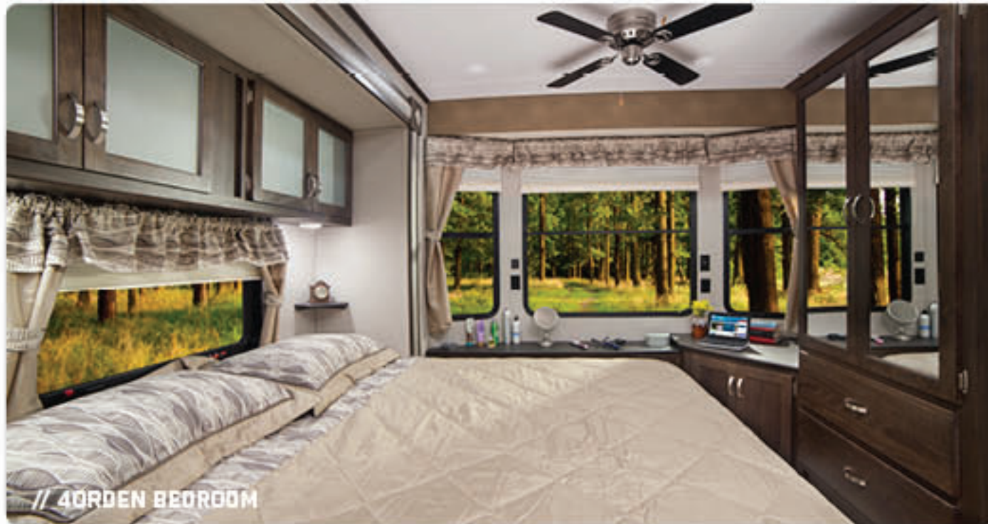
// 40RDEN BEDROOM