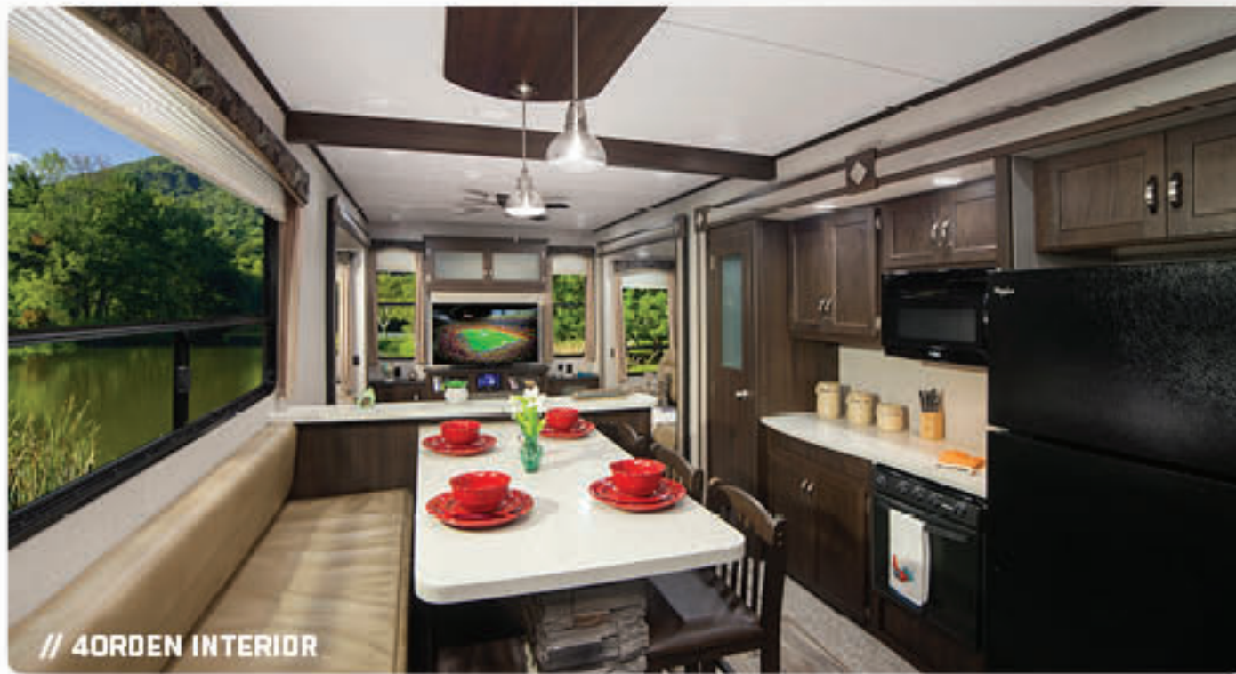
// 40RDEN INTERIOR