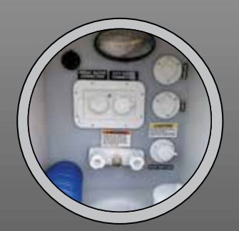
UNIVERSAL DOCKING CENTER (N/A BREEZE)