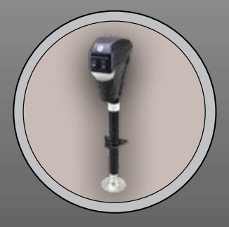
ELECTRIC TONGUE JACK (N/A BREEZE)