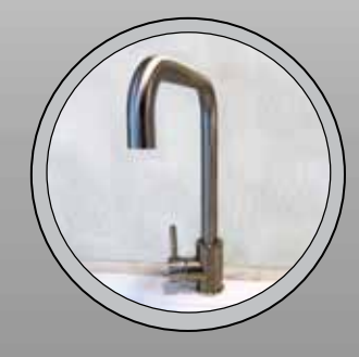
HIGH-RISE METAL FAUCET