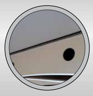
LED LIGHTED AWNING