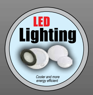
LED INTERIOR LIGHTING