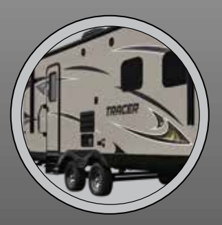
HIGH GLOSS GEL COAT (N/A BREEZE)