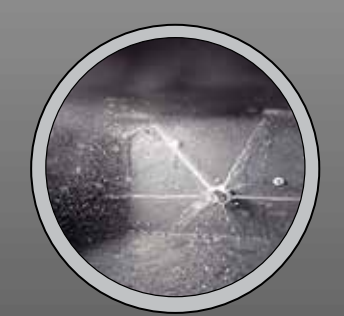
BLACK TANK FLUSH