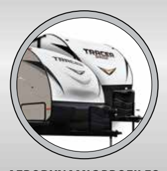
AERODYNAMIC PROFILES WITH ROCK GUARD