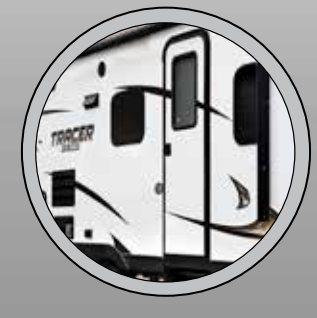
FRICTION HINGE ENTRY DOOR