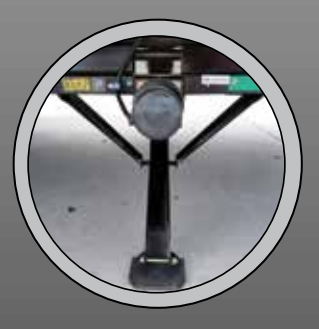
JACKS (N/A BREEZE)