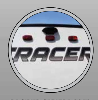
BACK UP CAMERA PREP