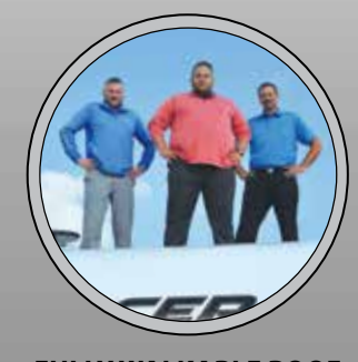
FULLY WALKABLE ROOF