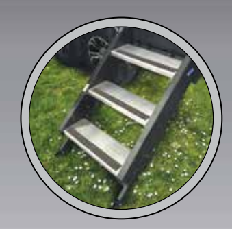
MORryde "STEP ABOVE" ZG ENTRY STEPS