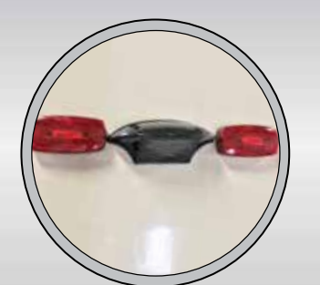
BACK UP CAMERA PREP