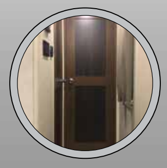
SHAKER STYLE INTERIOR DOORS