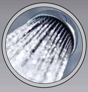
18 GPH DSI WATER HEATER