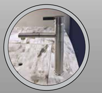
RESIDENTIAL KITCHEN SPRAYER FAUCET