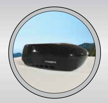
15K "QUIET COOL" A/C