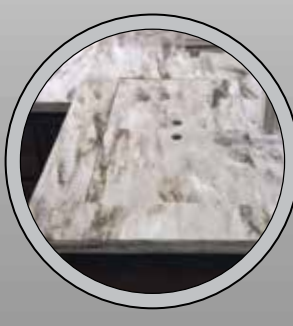
SOLID SURFACE COUNTERTOPS