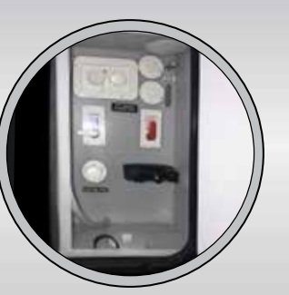
UNIVERSAL DOCKING CENTER