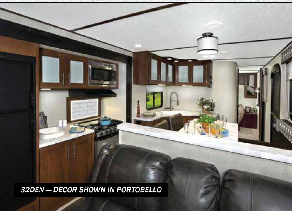
32DEN — DECOR SHOWN IN PORTOBELLO

For both the first-time buyer and seasoned camping veteran, the value-conscious Avenger often represents a customer's first experience with a recreational vehicle from Prime Time Manufacturing. Since first impressions are critical - and last a lifetime - we've insisted that Avenger combine comfort, convenience, and style with the industry's highest standard of quality and construction. By providing a GREAT ownership experience, Avenger is Prime Time's way of welcoming you to our family. We hope that your future journeys will always include a Prime Time RV.