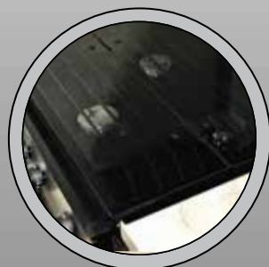
FLUSH MOUNT GLASS TOP RANGE COVER (N/A ATI)