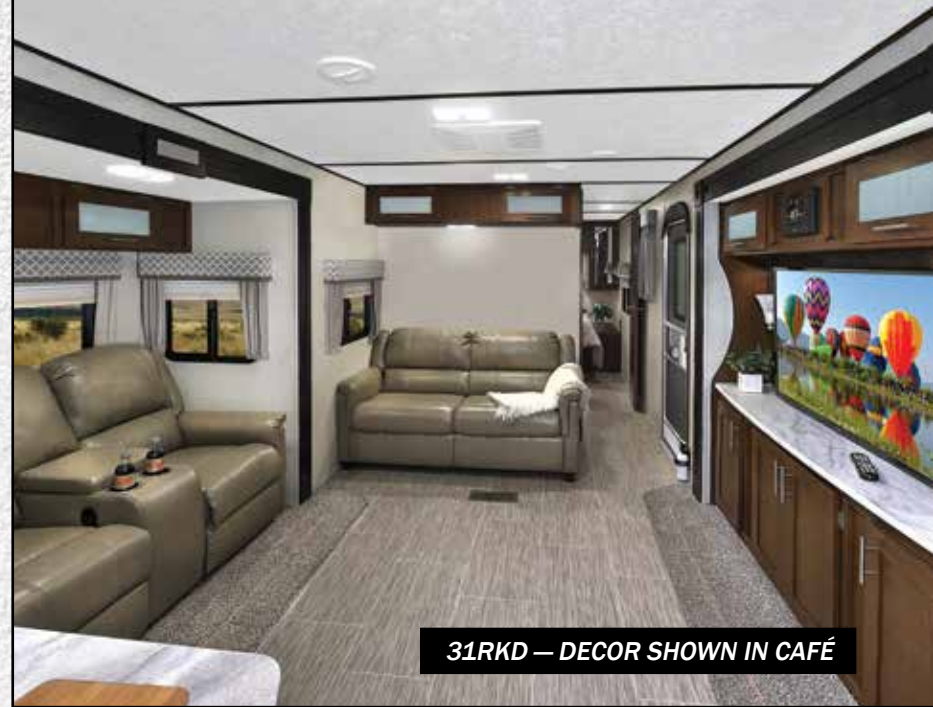
31RKD — DECOR SHOWN IN CAFÉ

To guarantee that Avenger provides true customer satisfaction, our engineers carefully examined every component, every small detail, and every process that went into Avenger's creation. It was important to offer industry-leading beauty, so shaker-style cabinet doors were paired with premium fabrics, flooring, and countertops for a luxurious appearance. "Best In Class" features and design elements are utilized to fully maximize customer enjoyment. Innovative EVERLAST® construction and demanding standards for testing were developed to ensure long-term quality and durability. If "Your Journey Begins Here," Avenger is sure to please.