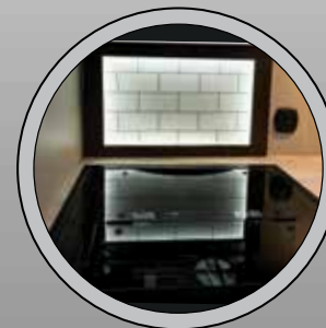
LED LIT KITCHEN BACKSPLASH