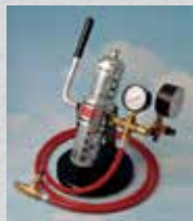
Seek-A-Leak Pressure Test

Prime Time Manufacturing is proud to be recognized as an industry leader in value, reliability, and overall quality by the Recreational Vehicle Dealers Association. We are committed to "A Higher Standard" in design, construction, testing, and customer service. Check us out — we know you'll be impressed!