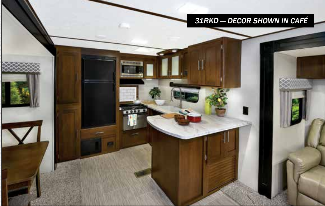
31RKD — DECOR SHOWN IN CAFÉ