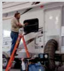
Seal Tech Air Pressure Test