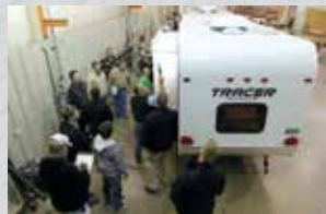
Executive Quality Audits