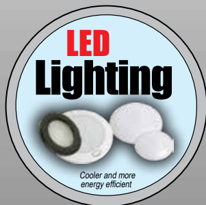
LED INTERIOR LIGHTING