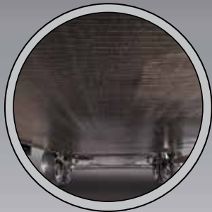
ENCLOSED UNDERBELLY (N/A ATI)