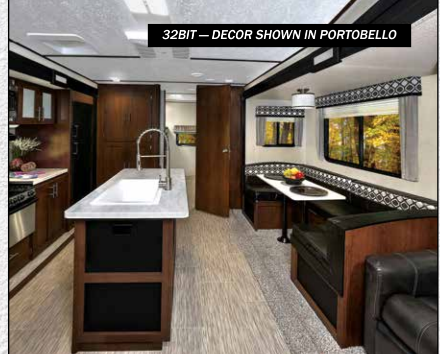
32BIT — DECOR SHOWN IN PORTOBELLO

For both the first-time buyer and seasoned camping veteran, the value-conscious Avenger often represents a customer's first experience with a recreational vehicle from Prime Time Manufacturing. Since first impressions are critical - and last a lifetime - we've insisted that Avenger combine comfort, convenience, and style with the industry's highest standard of quality and construction. By providing a GREAT ownership experience, Avenger is Prime Time's way of welcoming you to our family. We hope that your future journeys will always include a Prime Time RV.