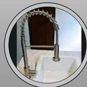
RESTAURANT STYLE KITCHEN FAUCET