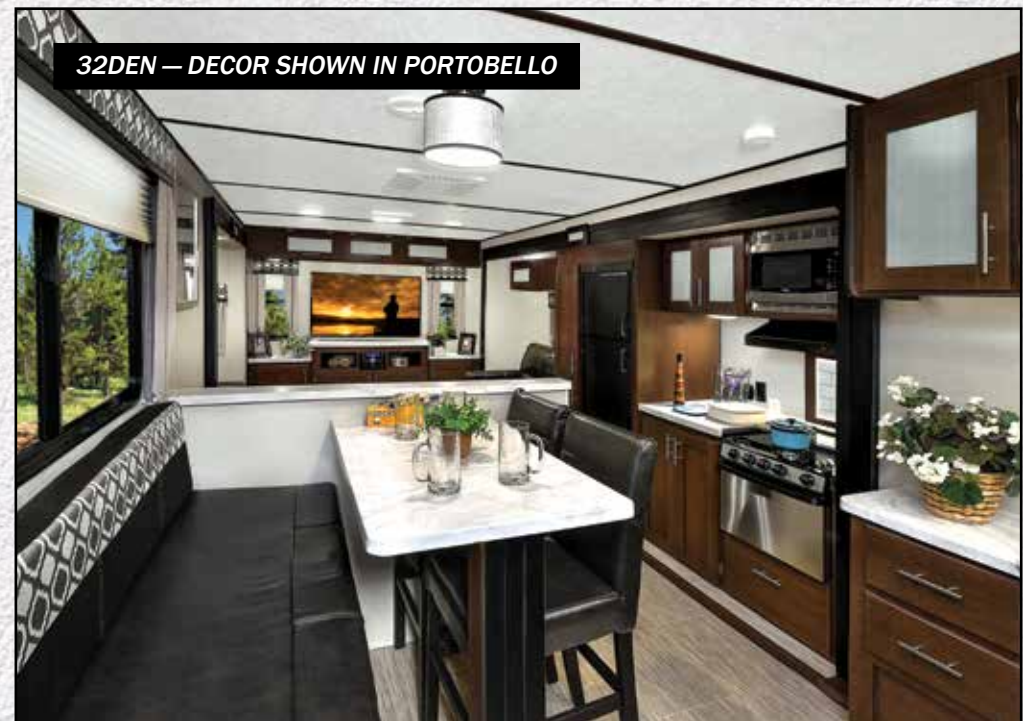
32DEN — DECOR SHOWN IN PORTOBELLO