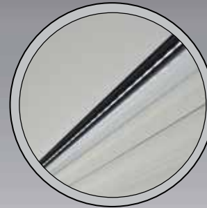
LED LIT POWER AWNING