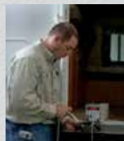
65 Point Secondary PDI