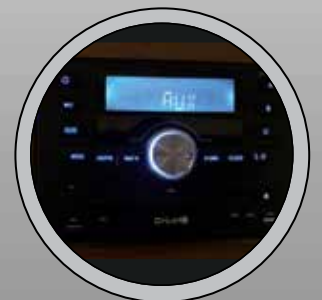
BLUETOOTH STEREO/DVD PLAYER (N/A 20RD, 21RB, 26BB, 26BK)