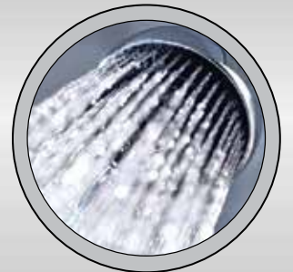
18 GPH DSI WATER HEATER