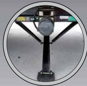
ELECTRIC STABILIZER JACKS (N/A ATI)