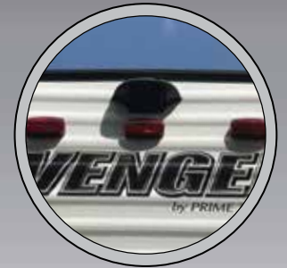
BACK UP CAMERA PREP