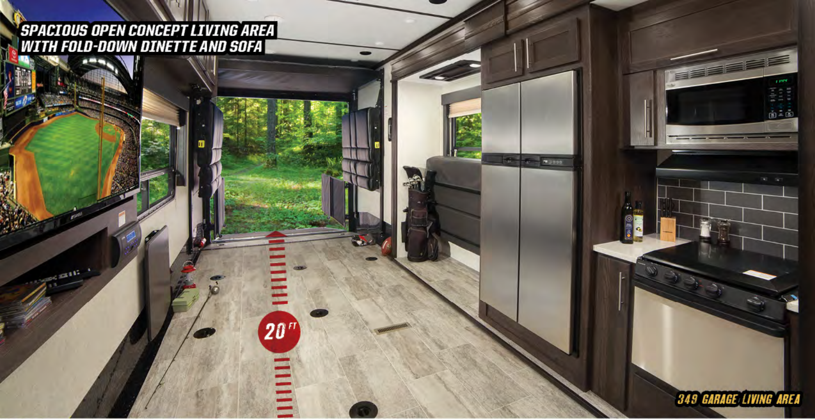
349 GARAGE LIVING AREA