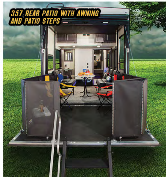
357 REAR PATIO WITH AWNING AND PATIO STEPS