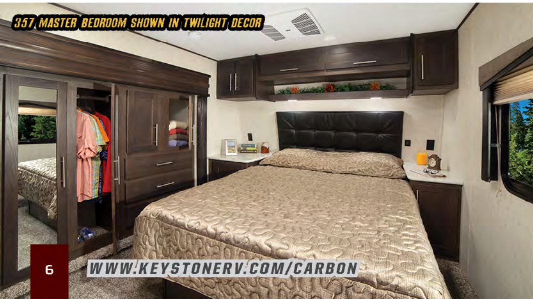
357 MASTER BEDROOM SHOWN IN TWILIGHT DECOR