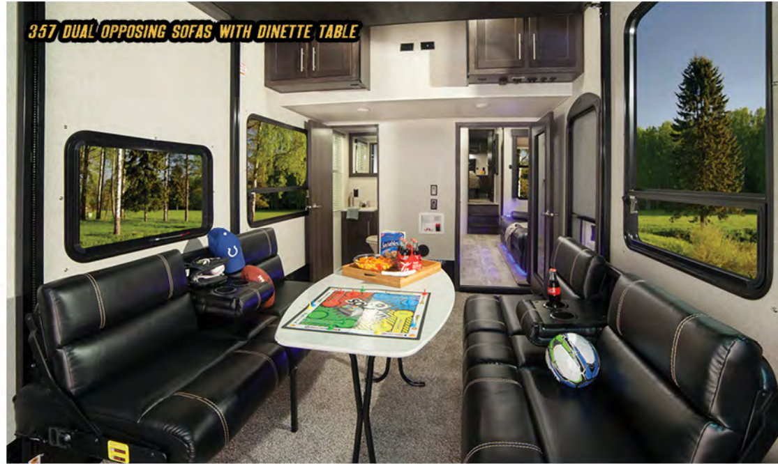
357 DUAL OPPOSING SOFAS WITH DINETTE TABLE