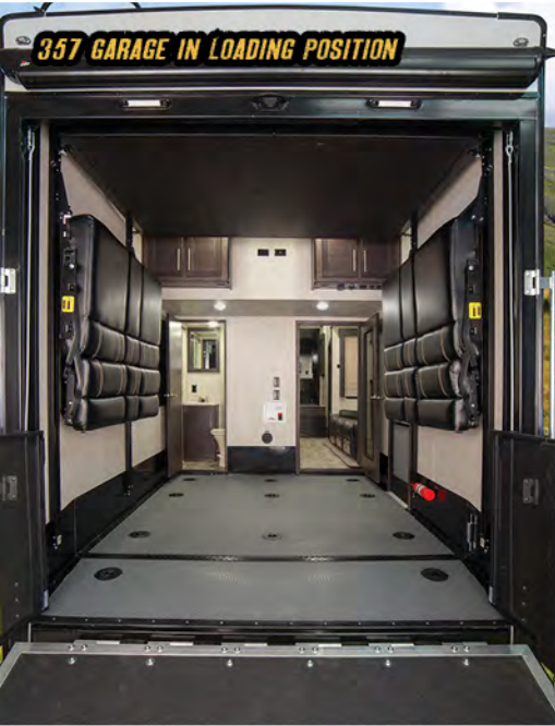
357 GARAGE IN LOADING POSITION