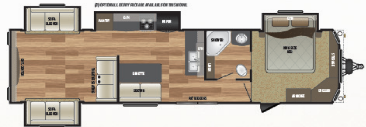
WEIGHT 12015 LENGTH 40' 11" 39/391RDEN NEW