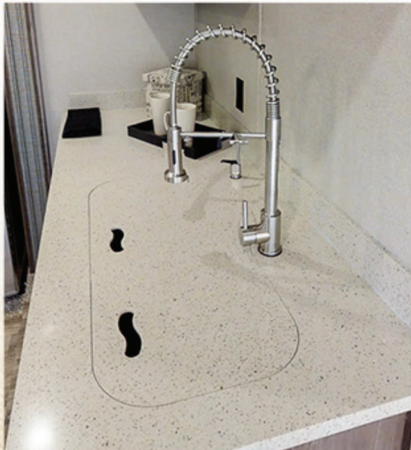
SOLID SURFACE COUNTERTOPS WITH STAINLESS STEEL UNDER MOUNT SINK AND CHEF FAUCET

LUXURY COMES STANDARD \ COMFORT AND LUXURY FOR THE WHOLE FAMILY