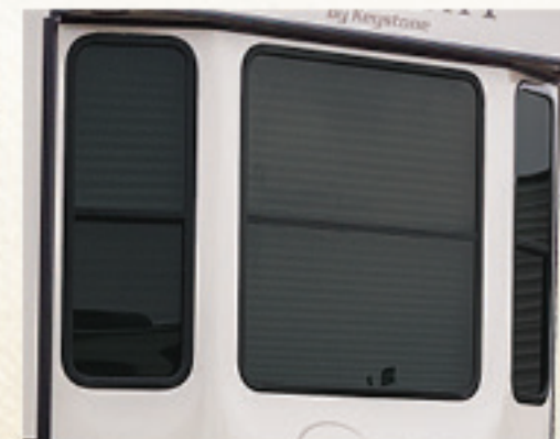
OPTIONAL DUAL PANE GLASS WINDOWS