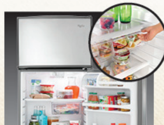
STAINLESS STEEL APPLIANCE PACKAGE