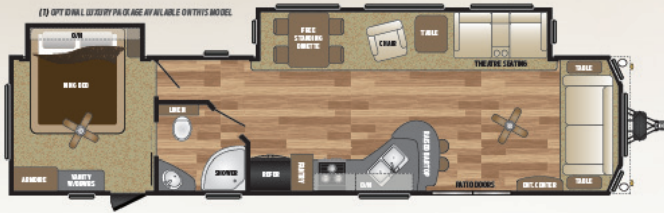
WEIGHT 10505 LENGTH 40' 11" 39/391FDEN REDESIGNED