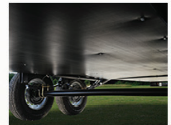
HEATED ENCLOSED UNDERBELLY