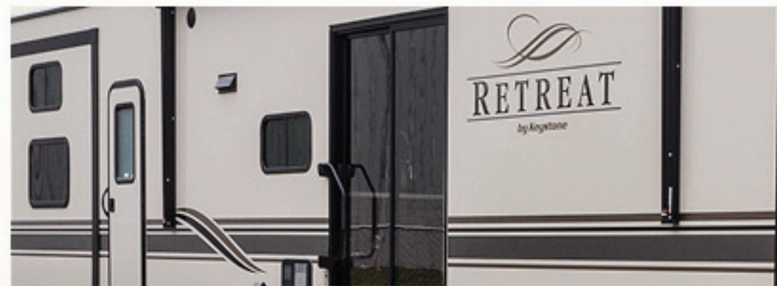
CHAMPAGNE LAMINATED SIDEWALL WITH UPGRADED GRAPHICS PACKAGE