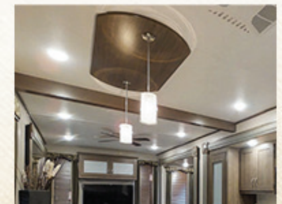
UPGRADED INTERIOR LIGHTING PACKAGE