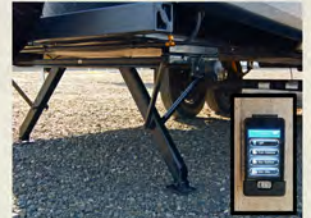
Power Stabilizer Jacks w/ Remote