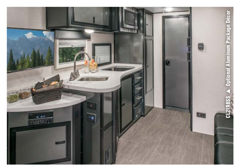
The optional aluminum décor package is available on all CampLites for a smart contemporary look.