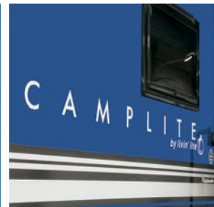
Deluxe Chrome Graphics