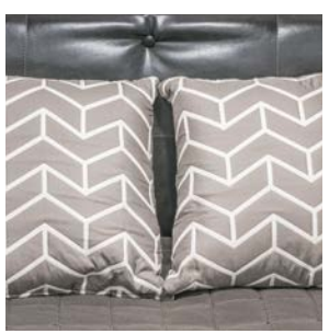
Decorative Pillow Package