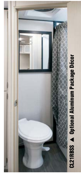
All CampLites come equipped with a stand-up shower and porcelain footflush toilet.