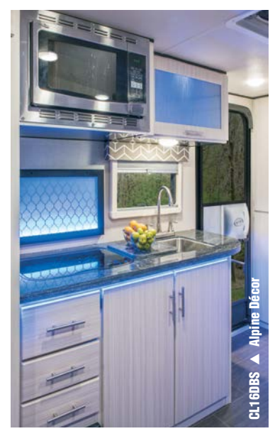
An abundance of storage is carefully designed into each unit featuring a strong all-aluminum tube cabinet structure.

When it's time to hit the road, CampLite scoots down the highway light and breezy thanks to its all-aluminum superstructure, which adds durable strength without a hefty weight. These quick and lively ultra light travel trailers are designed to get you where the fun is with easy towing efficiency. Available in six aluminum paint schemes and six fiberglass color choices, the jazzy exterior turns heads wherever you go!