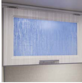
LED Lighted Backsplash at Cooktop LED Backlit Lighted Glass in Overhead Cabinets