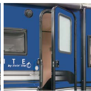
Friction Entry Door