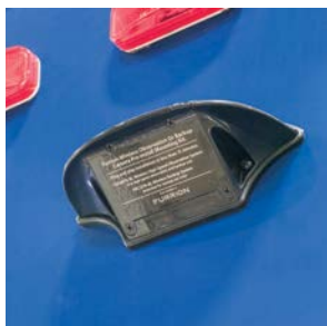
Backup Camera Prep