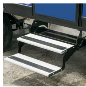
Double Aluminum Entrance Step