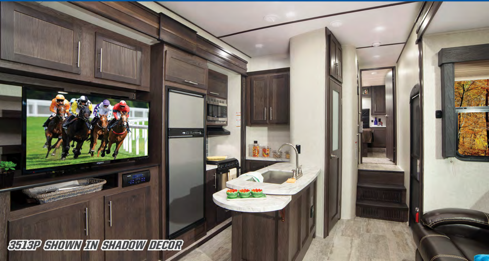
3513P SHOWN IN SHADOW DECOR