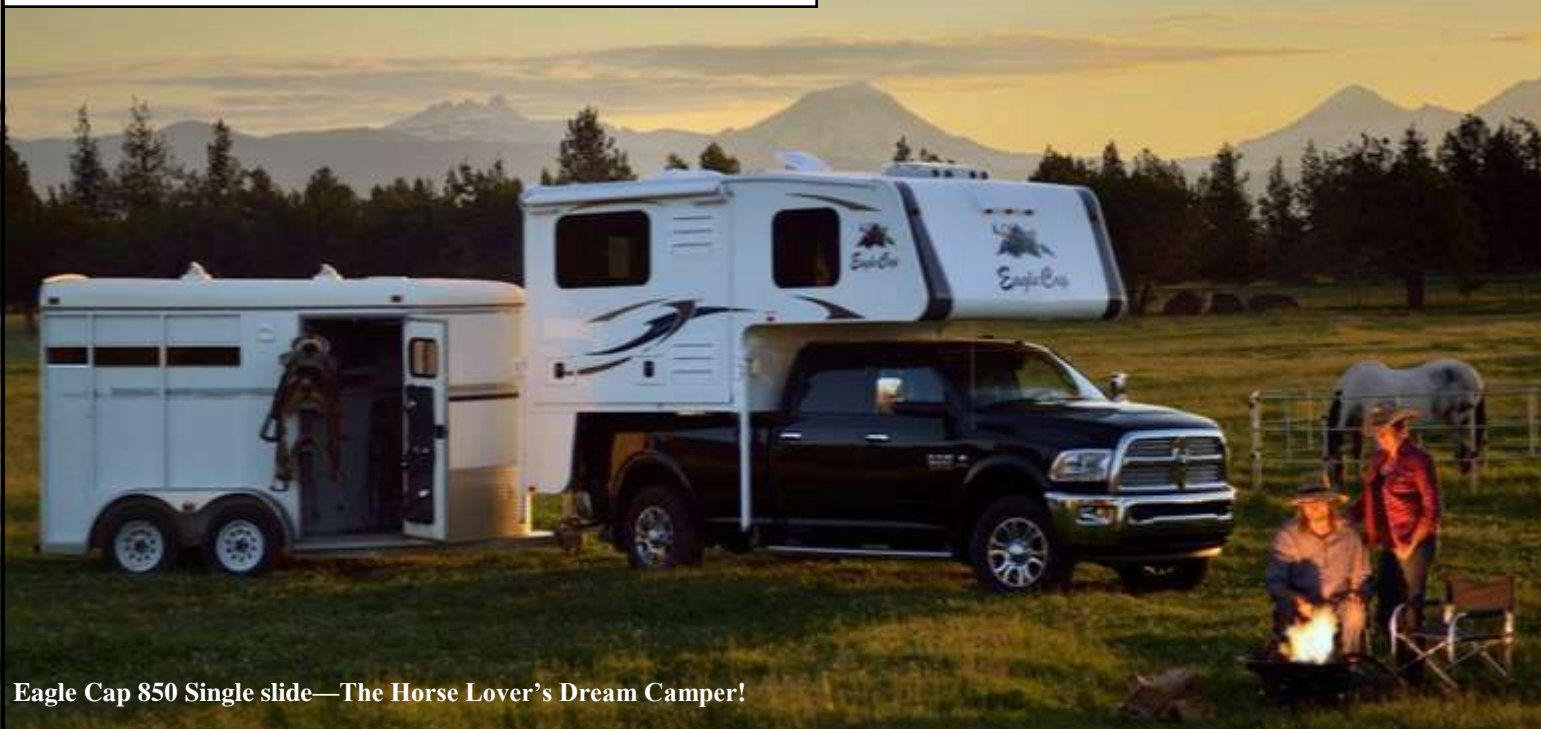
Eagle Cap 850 Single slide—The Horse Lover's Dream Camper!