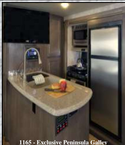
1165 - Exclusive Peninsula Galley