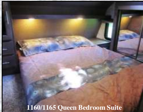
1160/1165 Queen Bedroom Suite

The 811 Eagle Cap has a roomy luxurious Queen Bedroom Suite with dual bedroom windows for that cool cross ventilation, dual door wardrobe and an ALP exclusive Camper Caddy Storage system... Best Truck Camper - built like none other!