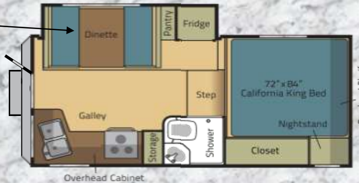
960 Fits LB Trucks (8') only