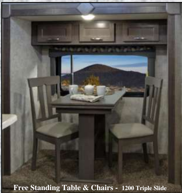
Free Standing Table & Chairs - 1200 Triple Slide

This Eagle Cap exclusive was born out of our collaboration with large 5th wheel and motorhome customers/owners looking for those high end luxury amenities. They found them in Eagle Cap.