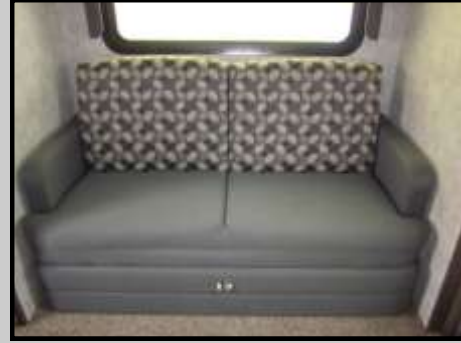
2018 Sofa / Bed w/storage drawer - Denim Decor