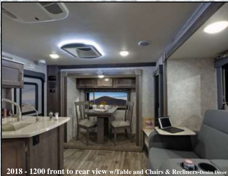
2018 - 1200 front to rear view w/Table and Chairs & Recliners-Denim Decor