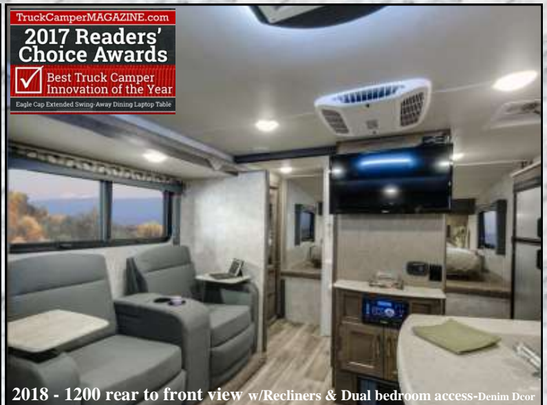
2018 - 1200 rear to front view w/Recliners & Dual bedroom access-Denim Decor