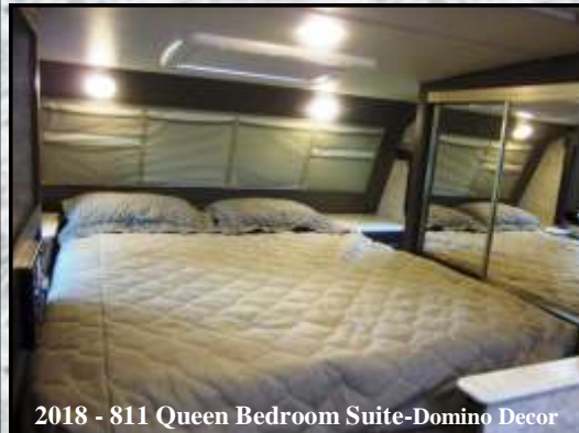
2018 - 811 Queen Bedroom Suite-Domino Decor

The 811 Eagle Cap has a roomy luxurious Queen Bedroom Suite with dual bedroom windows for that cool cross ventilation, dual door wardrobe and an ALP exclusive Camper Caddy Storage system... Best Truck Camper - built like none other!