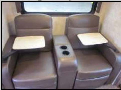
2018 Theater Seating - w/Swing-Away Tables - Domino Decor