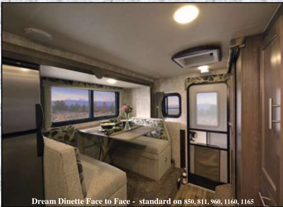
Dream Dinette Face to Face - standard on 850, 811, 960, 1160, 1165

Eagle Cap features the standard Dream Dinette where you don't have that annoying table leg in your way, giving you more foot room in your dinette. The best part about this dinette is with the flip of a lever the table simply presses down to make into a bed without having to remove the whole table, to restore it back to a dinette you simply pull the gas propped table up and lock the lever!