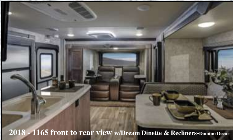
2018 - 1165 front to rear view w/Dream Dinette & Recliners-Domino Decor

Top Right - 1200 Rear to Front View. Notice the extremely large open space in this largest in the Industry 12' Truck camper. Note the dual access to the California King (72"x 84") Bedroom Suite. Also note the optional 32" Living room TV and the Theater Seating Recliners shown here with the all new Swing Away Tables in Denim Décor ...