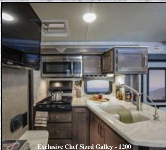
Exclusive Chef Sized Galley - 1200

Eagle Cap Luxury not seen in the industry!