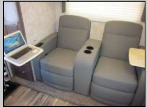
2018 Theater Seating - w/Swing-Away Tables - Denim Decor