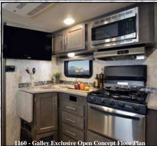
1160 - Galley Exclusive Open Concept Floor Plan

The Eagle Cap 1160 Double Slide enjoys a large galley with abundant overhead cabinet storage and plenty of counter space. The Stainless Steel Appliances really accent this open concept living, dining and Galley floorplan... This model gives you the largest floor space in a truck camper!