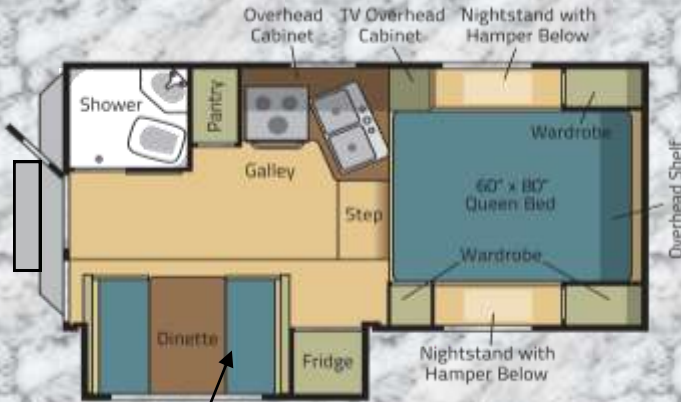
850 Fits SB and LB Trucks (6' to 8' - (Fits SB only w/Generator)