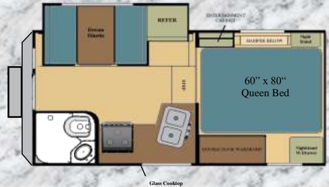
811 Fits SB and LB Trucks (6' to 8' even w/Generator)