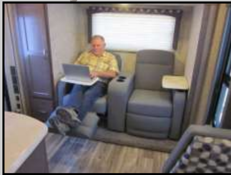
2018 Theater Seating - w/Swing-Away Tables - Denim Decor