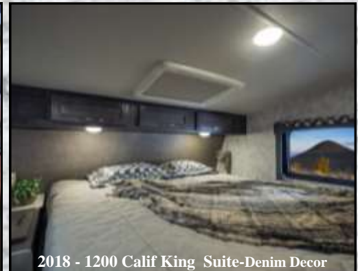
2018 - 1200 Calif King Suite-Denim Decor

The 1160/1165 Eagle Cap has a Secluded Bedroom Suite with dual bedroom windows for cross ventilation and it includes a double door wardrobe for plenty of hanging and storage... Luxury Bedrooms - built like none other!