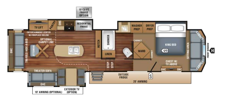
PINNACLE 37RLWS OPTIONS: A. C Ext. Lgth: 41' 7" Ext. Ht: 161" Unloaded Wt. (lbs): 13,965 Sleeps: 4