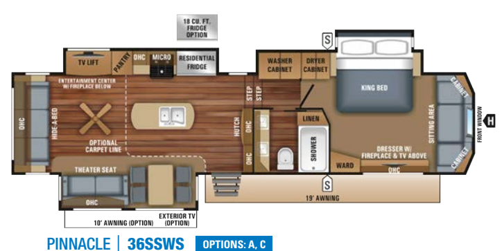
Ext. Lgth: TBD Ext. Ht: TBD Unloaded Wt. (lbs): TBD Sleeps: 4-5