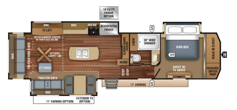
PINNACLE 36KPTS OPTIONS: A, B, C Ext. Lgth: 41' 0" Ext. Ht: 160" Unloaded Wt. (lbs): 13,255 Sleeps: 4