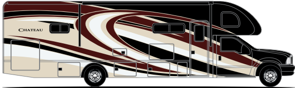
CHERRY TRAILS FULL-BODY PAINT