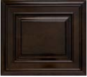
HIGH-GLOSS GLAZED MILAN