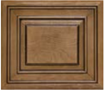
HIGH-GLOSS GLAZED NEWPORT