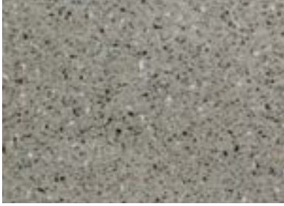
KITCHEN & DINETTE COUNTERTOP