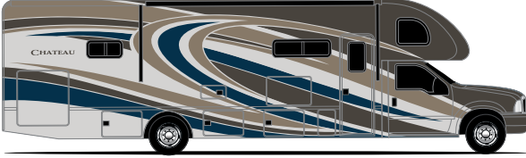
WINDING WATERS FULL-BODY PAINT