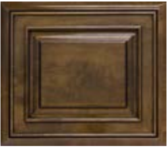
HIGH-GLOSS GLAZED PACIFIC