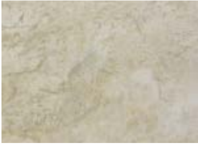
BED & BATH COUNTERTOP