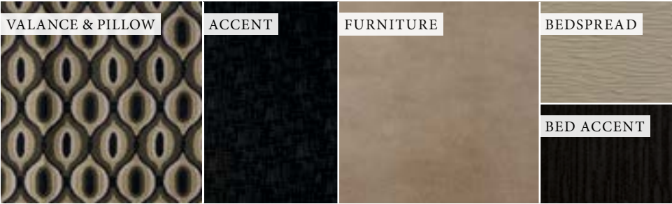
FADE TO BLACK