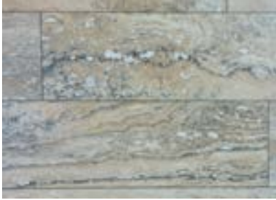
RESIDENTIAL VINYL FLOORING