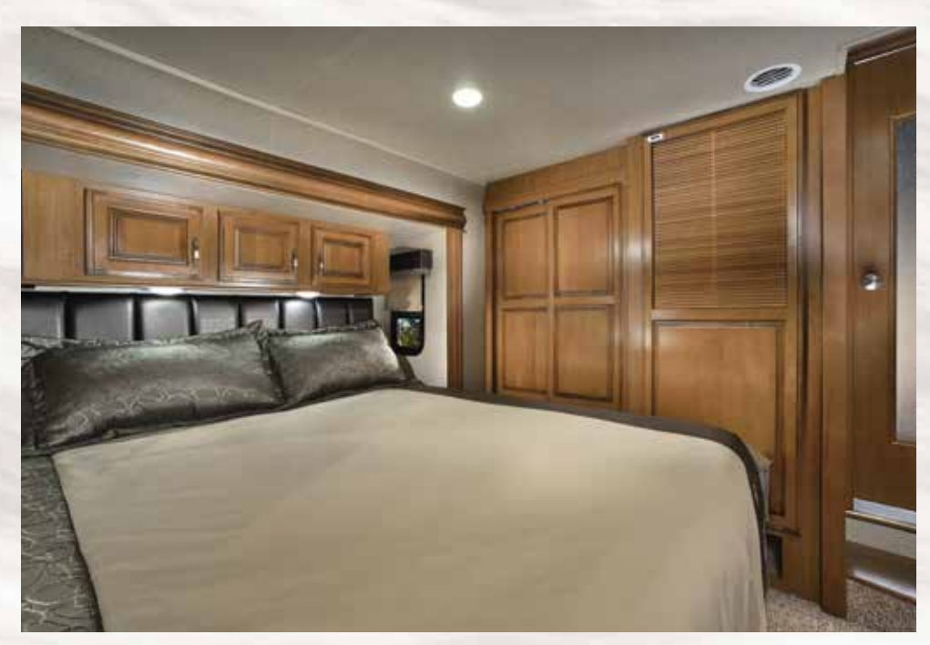
Cottage master bedrooms include a Serta® King residential mattress, luxury bedding, a washer/dryer closet, and generous storage space. (40CL bedroom above, 40CCK bedroom below)