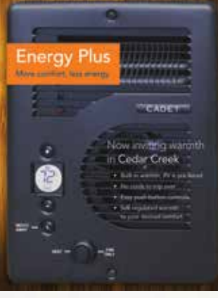
Optional Cadet wall mounted heater. Enjoy quiet, comfortable, self-regulating heat or fan only air circulation in the bedroom while using less propane.