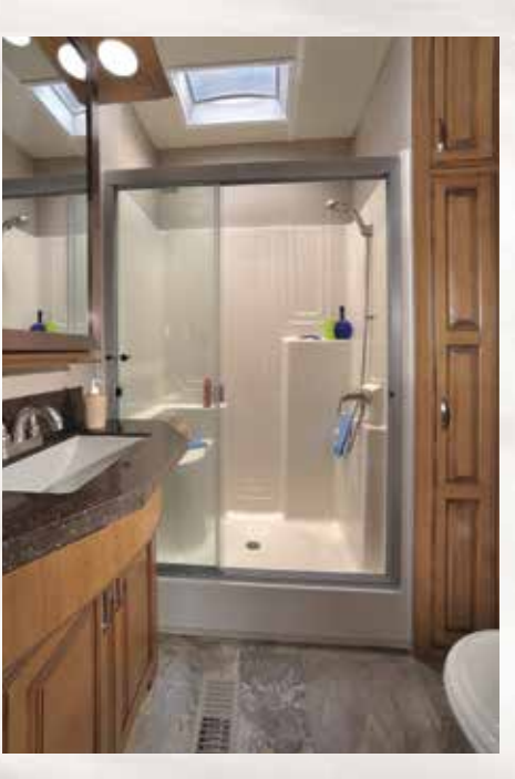
Cottage bathrooms feature a 48" residential, one-piece fiberglass rectangular shower with sliding glass doors, a large seat and an upgraded shower head. An 18" circular flow porcelain toilet and linen cabinet complete this spacious bathroom.

The Cottage Edition 102" wide body trailer offers more square footage of quality living space with outstanding furnishings.