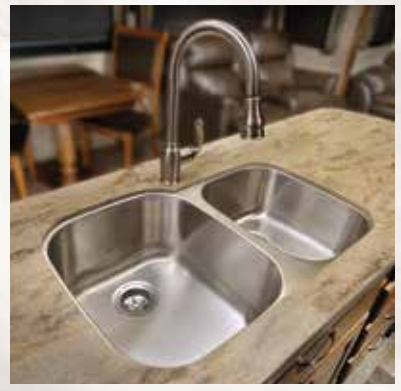
This huge under-counter mount, 60/40 double-bowl stainless steel kitchen sink comes with LG<sup>®</sup> sink covers.