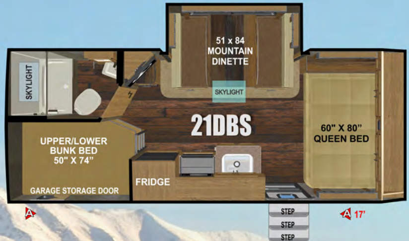
DRY WEIGHT: TBD ~ FLOOR LENGTH: 21'