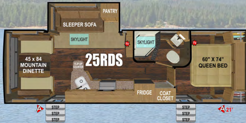
DRY WEIGHT: 7080 ~ FLOOR LENGTH: 26'

MOST MODELS AVAILABLE IN BOTH MOUNTAIN AND TITANIUM SERIES