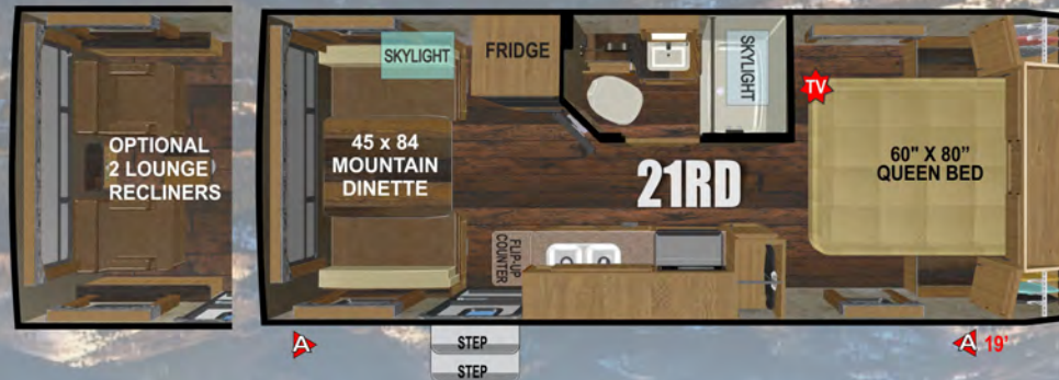
DRY WEIGHT: 4995 ~ FLOOR LENGTH: 21'

TV Indicates locations for living room 12v TV's and bedroom TV prep