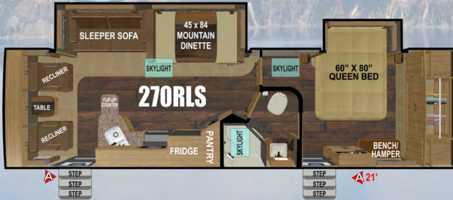
DRY WEIGHT: TBD ~ FLOOR LENGTH: 30'