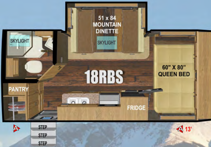
DRY WEIGHT: TBD ~ FLOOR LENGTH: 18'