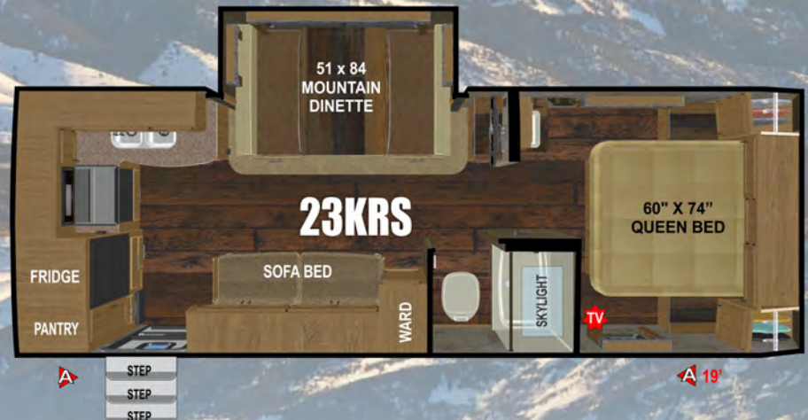
DRY WEIGHT: 5995 ~ FLOOR LENGTH: 23'