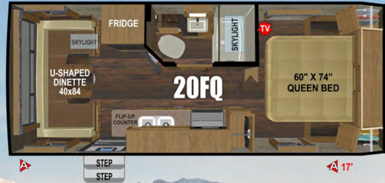
DRY WEIGHT: 4700 ~ FLOOR LENGTH: 20'