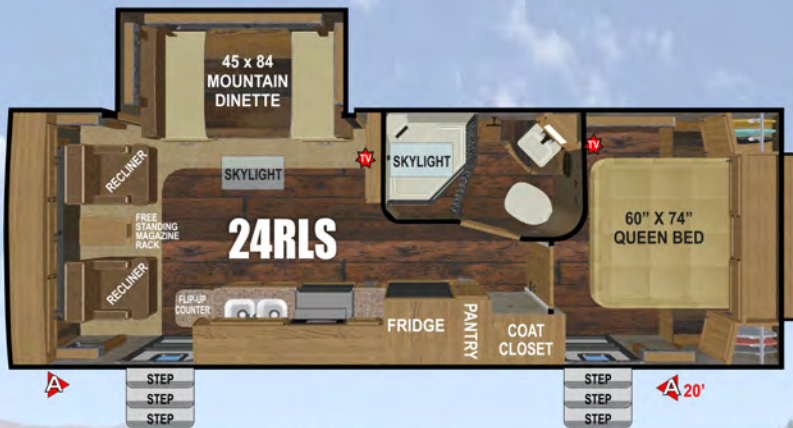
DRY WEIGHT: 6650 ~ FLOOR LENGTH: 24'