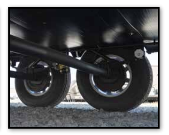
Dexter Axles with 3-3/8" brakes