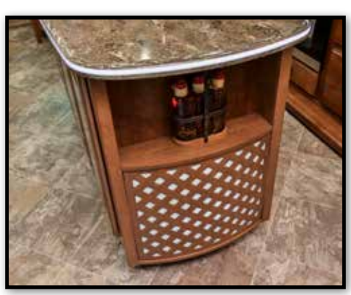
ISLAND END SHELF