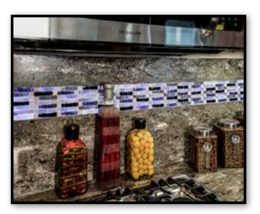
BACKLIT KITCHEN BACKSPLASH TILE