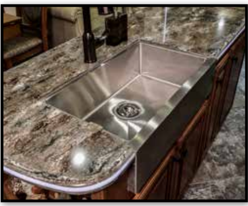
SINGLE BASIN FARMHOUSE SINK