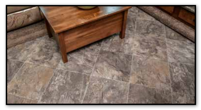
Fully laminated floor no weak spots.