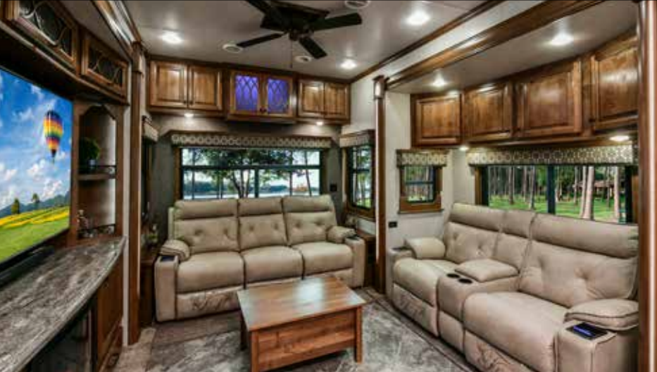
65" TV WITH OPTIONAL THEATER SEATING WITH USB, HEAT, POWER AND STORAGE DRAWERS.