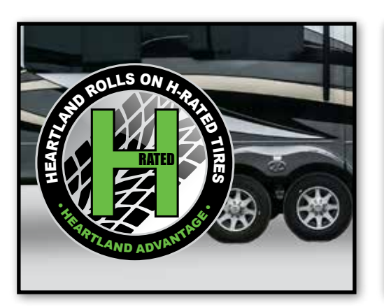
H-RANGE TIRES ON 8,000LBS AXLES