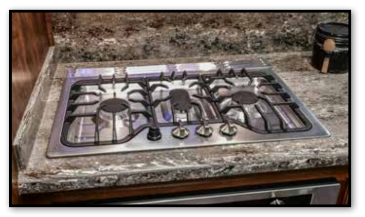
THREE BURNER GAS COOKTOP WITH AUTO IGNITE.