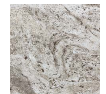
BEDROOM & BATHROOM COUNTERTOP