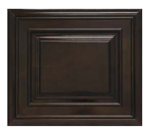
HIGH-GLOSS GLAZED MILAN