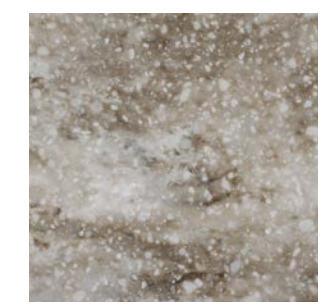
KITCHEN & DINETTE Countertops