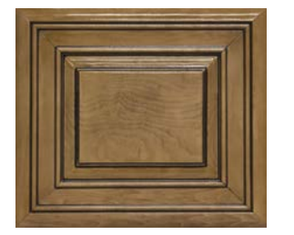
HIGH-GLOSS GLAZED NEWPORT