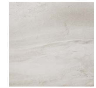
POLISHED PORCELAIN TILE FLOORING