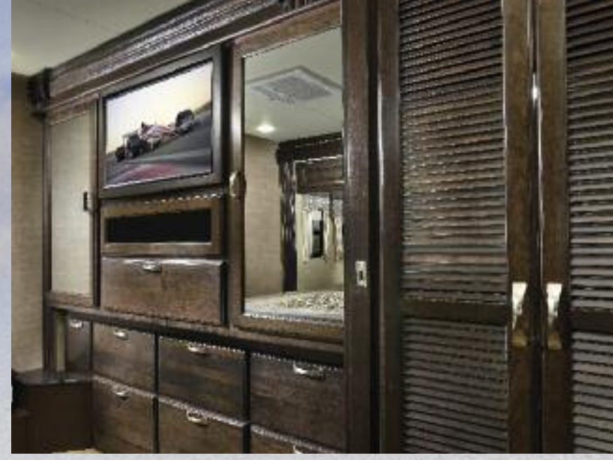
All DX3 bedrooms are tastefully appointed with rich hardwoods, a 32" TV, Soundbar, and Blu-Ray DVD Player.