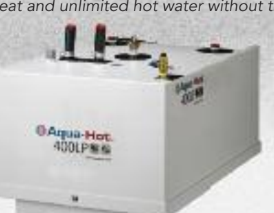
by a traditional LP furnace. It also offers utility bay heat, zoned heating, and dual power sources.

Designed and created by an RV enthusiast, our Aqua-Hot hydronic heating system provides quiet, evenly-distributed heat and unlimited hot water without the dryness created