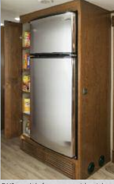
DX3 models feature a residential stainless steel refrigerator with an ice maker.