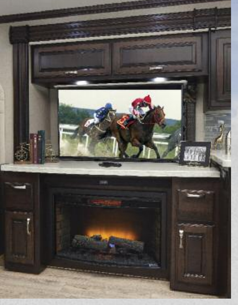
Optional Entertainment Center with 50" TV and Fireplace in place of Comfort Lounge

Optional Dual Reclining Theater Seats in place of Sofa