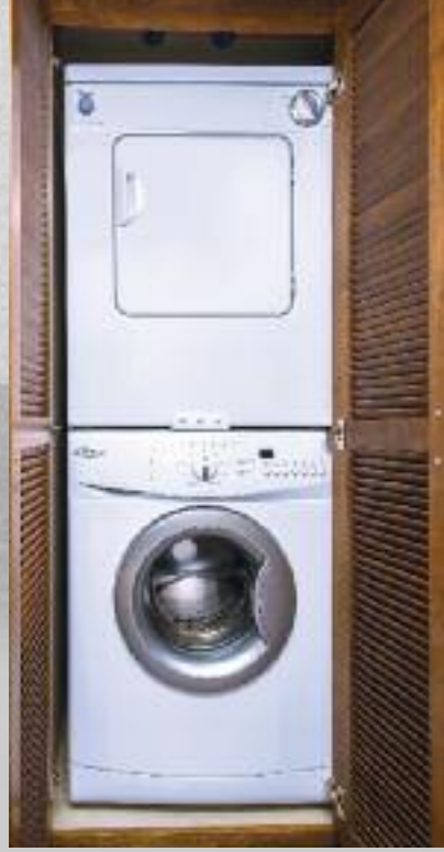
Optional washer and dryer