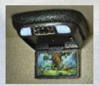
The 37BH is great for family and friends with 28" x 76" bunk beds. Each bunk features a 10.2" flip-down color monitor with built-in DVD player.