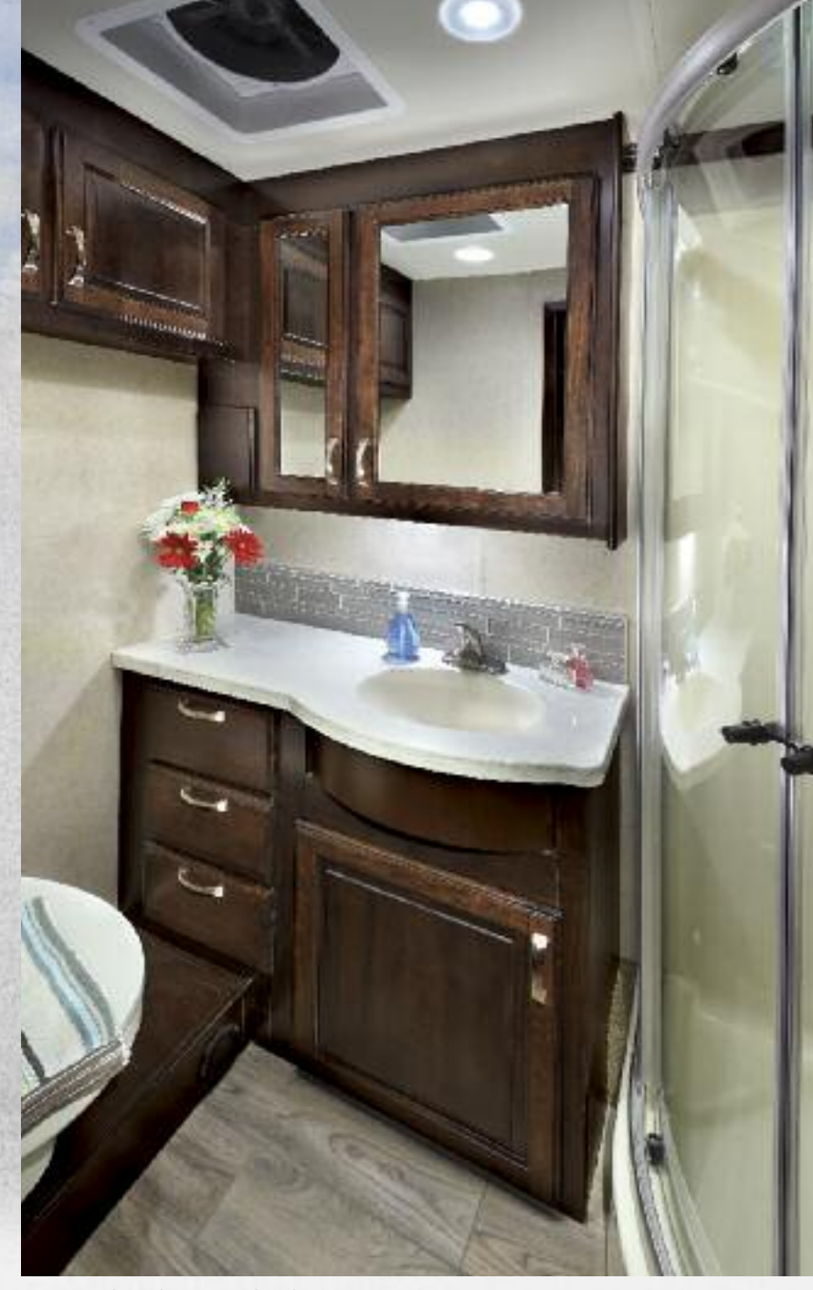
37BH with Rich Caramel Cabinets