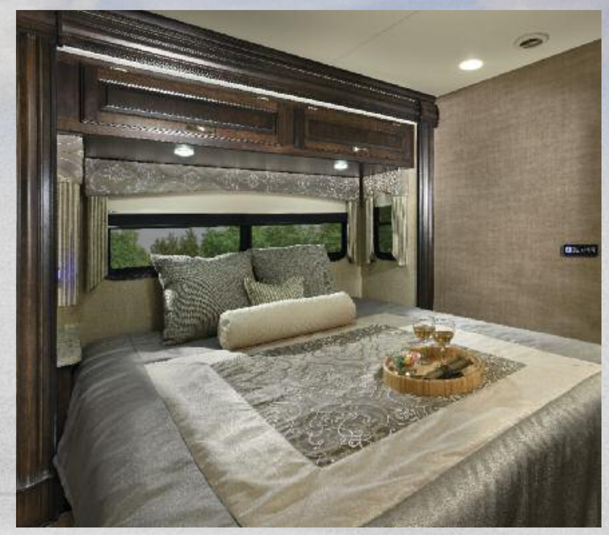
Every DX3 includes a residential memory foam mattress with iCool technology. This gel-infused memory foam has all the properties of memory foam with the added benefit of cooling gel beads. These tiny beads bond with the foam, allowing more airflow to regulate the mattress temperature throughout the night.