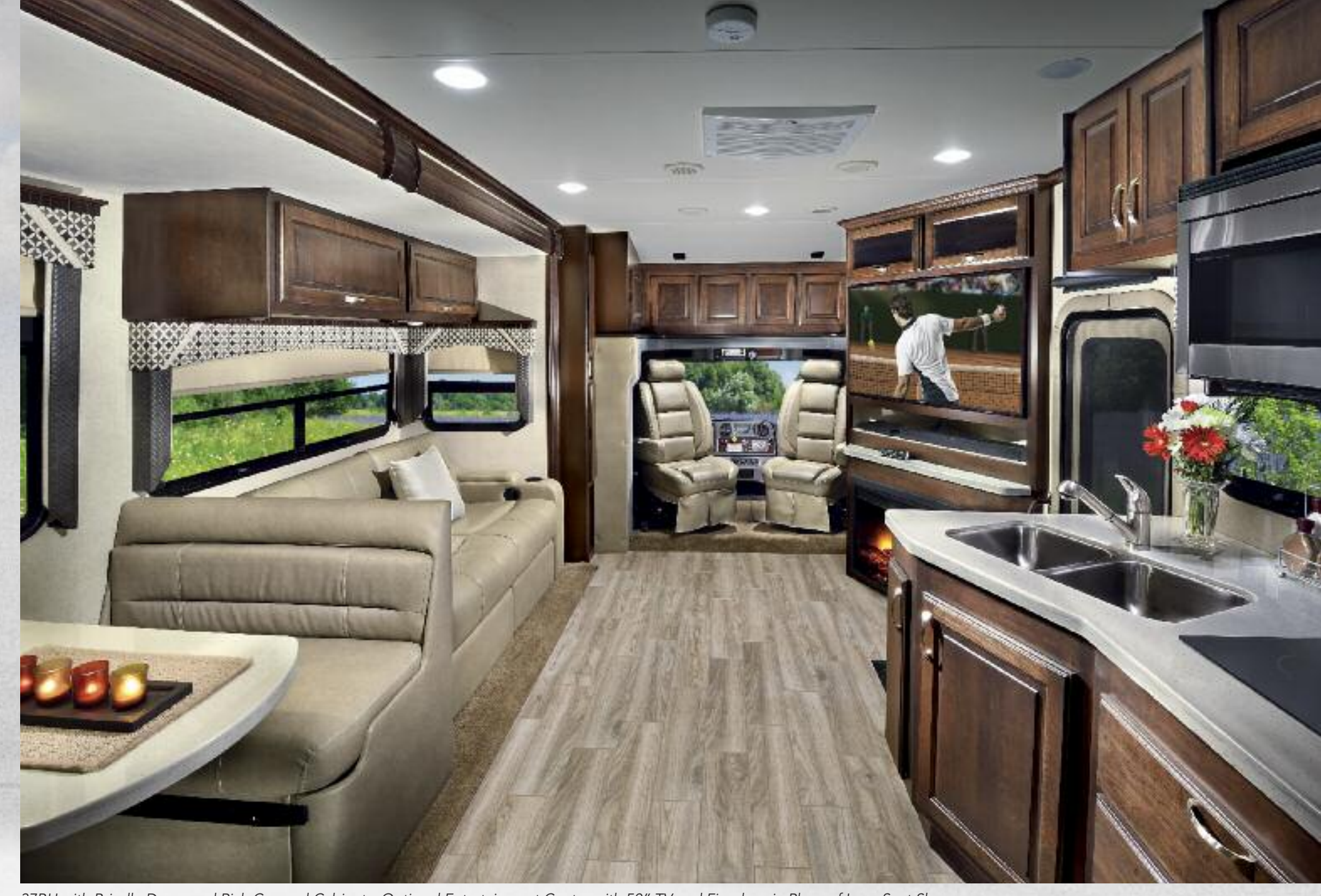
37BH with Brindle Decor and Rich Caramel Cabinets. Optional Entertainment Center with 50" TV and Fireplace in Place of Love Seat Shown.