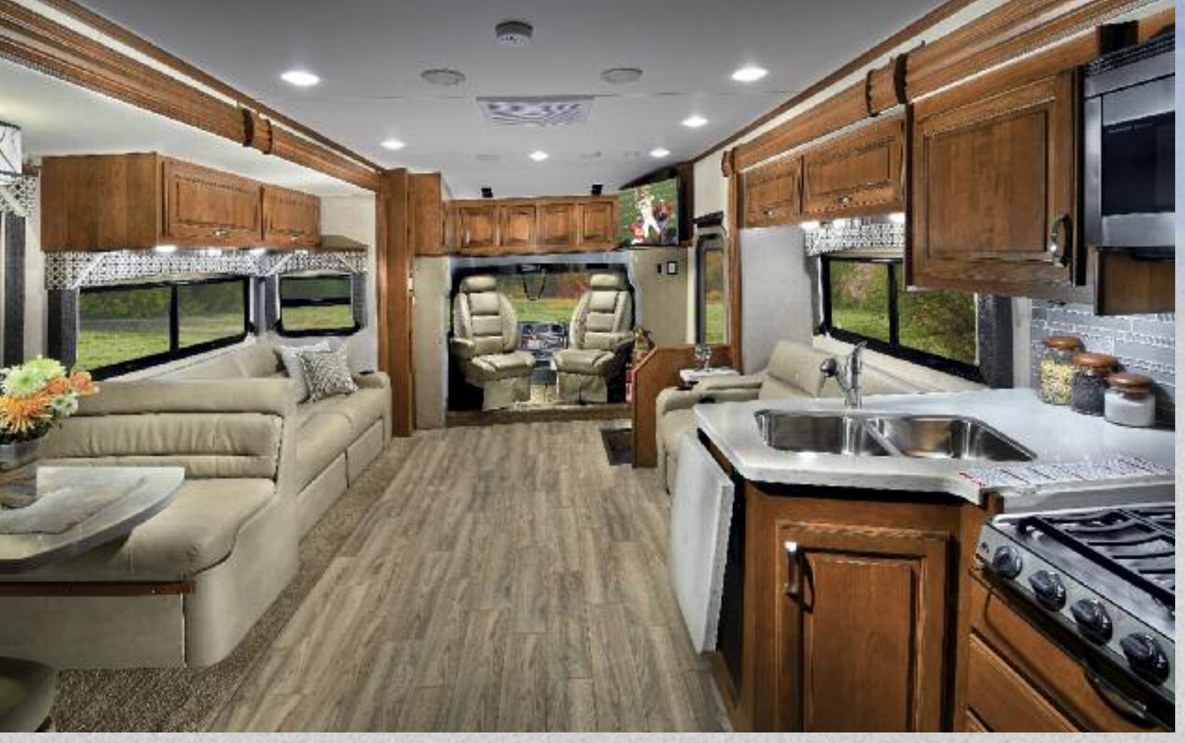
37TS with Brindle Décor and Early American Cherry Cabinets