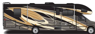
Carefree Paint Package

Entegra Coach, Inc., P.O. Box 460, Middlebury, IN 46540, www.entegracoach.com . See dealer for further information and prices. All information in this brochure is the latest available at the time of publication approval. Entegra Coach reserves the right to make changes and to discontinue models without notice or obligation. Photos in this brochure may show optional equipment and props for photography purposes. RVs built for sale in Canada may differ to conform to Canadian codes. ©2018 Entegra Coach, Inc., Entegra Esteem flyer 2018.indd EJ 9-17 Printed in U.S.A.