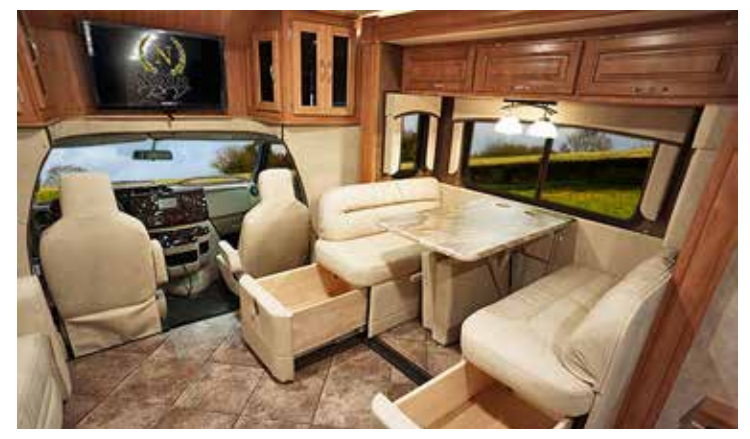
Relax or entertain in the Viper 29V lounge area with luxurious, comfortable furniture and large locking dinette drawers for pastime essentials.