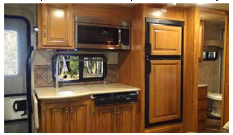
The Viper 25V has an efficient kitchen design for preparing your favorite meals as well as storing your cooking essentials.