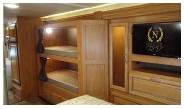
The Phantom 32P bunks are roomy with added storage for guests and the lighted the wardrobe with deep drawers provide much needed space for extended stays.