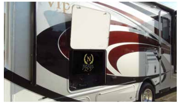
An optional outside entertainment center with LED TV is situated under a retractable awning for times when you want to enjoy the outdoors.