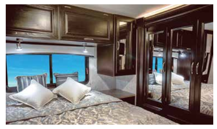
What better way to rest and relax than in a Phantom 31P private master suite. Expansive, large mirrored closet with drawers underneath. Additional storage in spacious over-the-bed cabinets with individual LED reading lights.