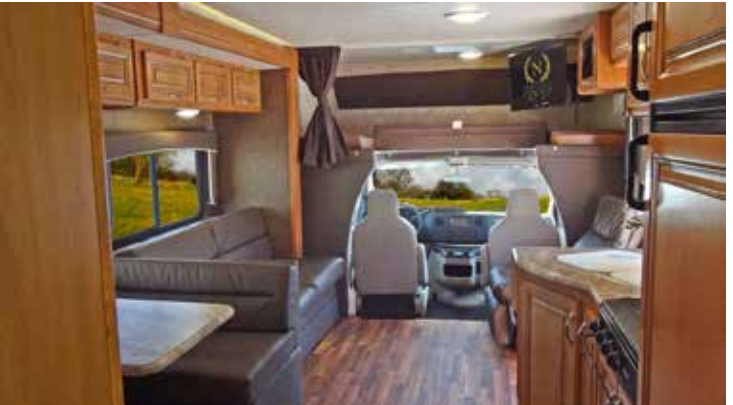
This Phantom 31P Class C motor home is furnished with an appreciable amount of floor space and generous and multiple storage areas with all the amenities of home.

Built on a Ford chassis with a V-10 engine, the all steel cage construction gives you the safest and best driving experience in the Class C industry.