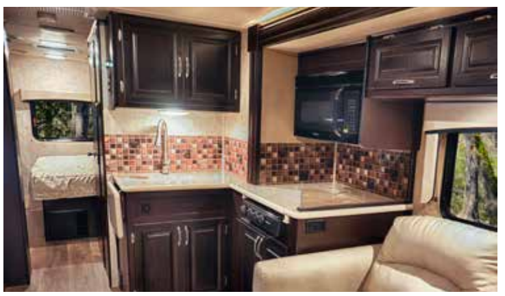
Viper upgrades truly provide a residential feel. 29V shown with beautiful dark forest wood cabinetry, solid surface counter tops, a large microwave, and a deluxe faucet.