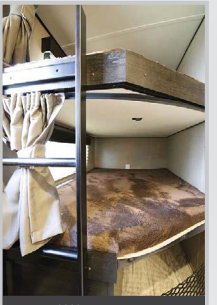
2800BH BUNK AREA

HEATED WALL HUGGER THEATRE SEATS W/ MASSAGE & LED LIGHTS