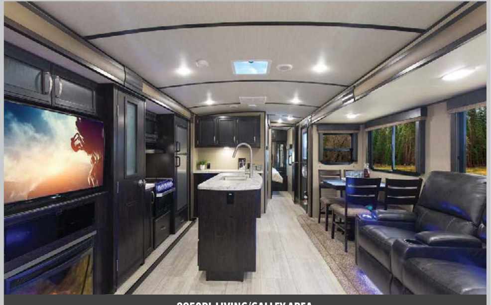
2950RL LIVING/GALLEY AREA