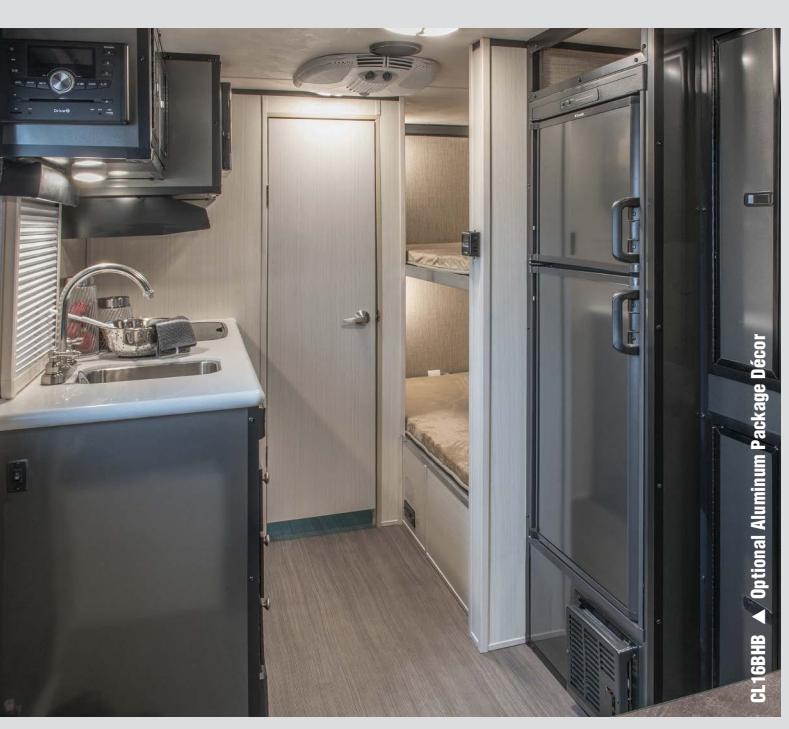
Solid aluminum cabinets are optional on all CampLites.