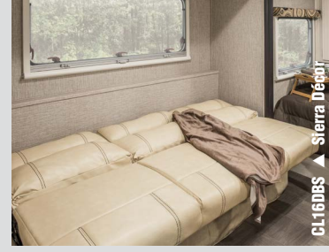
Jackknife sofa. where applicable, is large enough to sleep two!