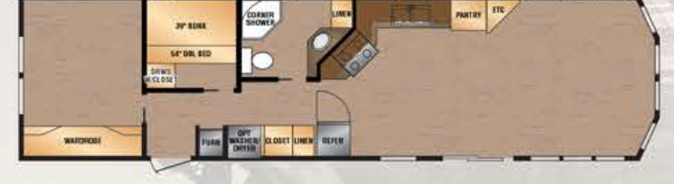
5066 12' x 48'