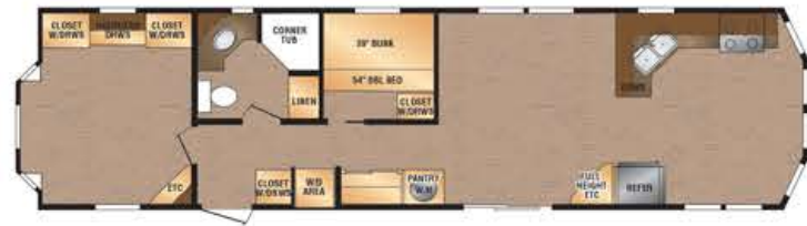
4201 C 12' x 45'