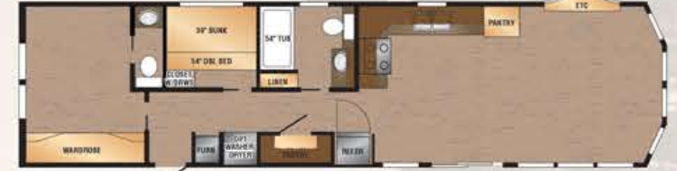
6024F 12' x 48'