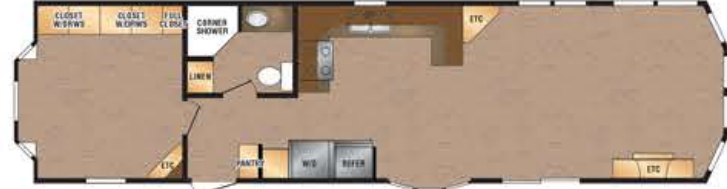
4261 12' x 45'