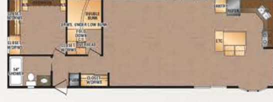
4550 14' x 38'