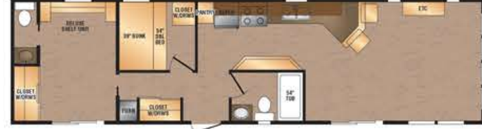
4987 12' x 42'