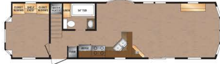
4353 12' x 42' - Rear Loft