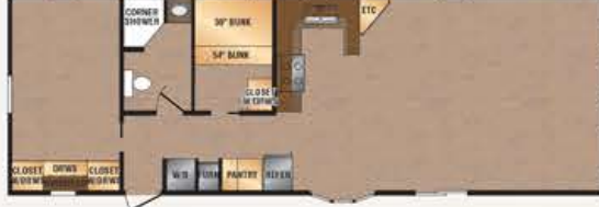
4721 14' x 38'