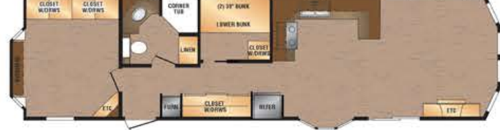
4270B 12' x 45'