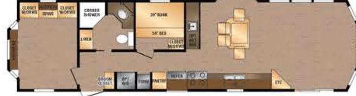
4775 12' x 42'