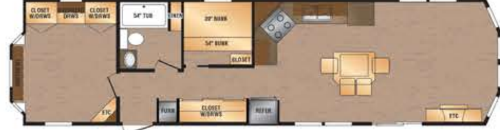
4270I 12' x 45'