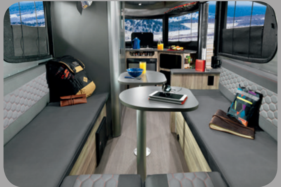
Group seating option – U-lounge seating for 5