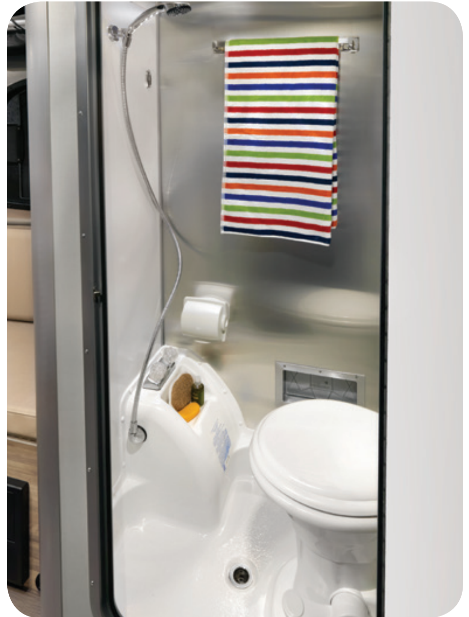
The full wet bath takes the sting (and stink) out of remote adventures.