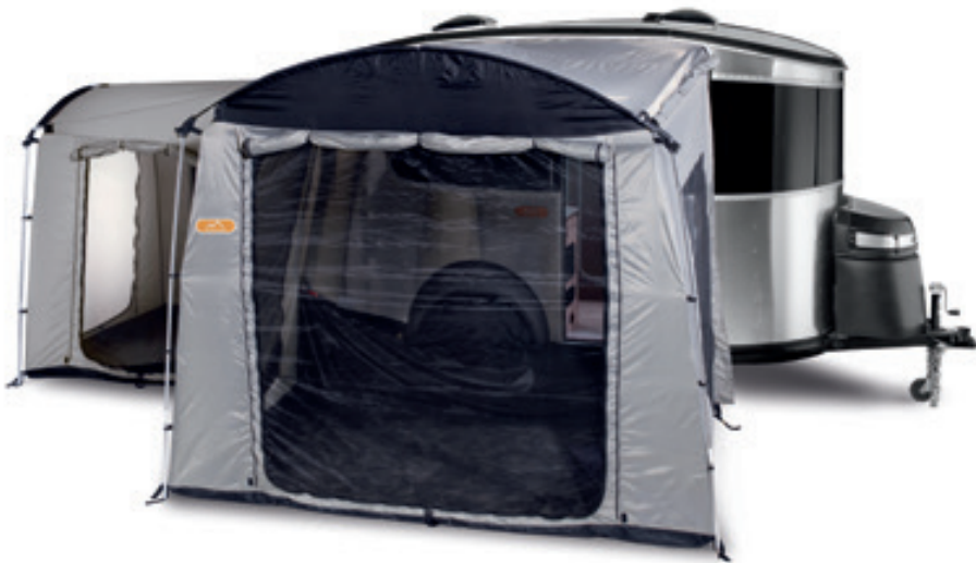
Keep the bugs out and the gear close with optional patio and rear tents.