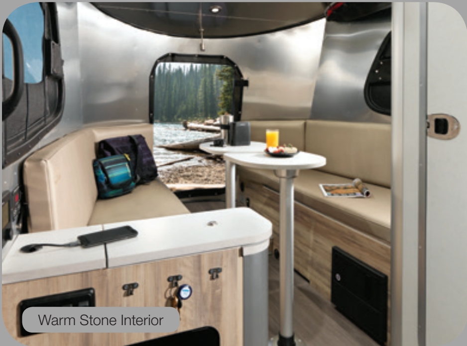
Warm Stone Interior