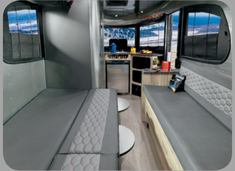
Half bed sleeping option – 38 in. x 76 in.