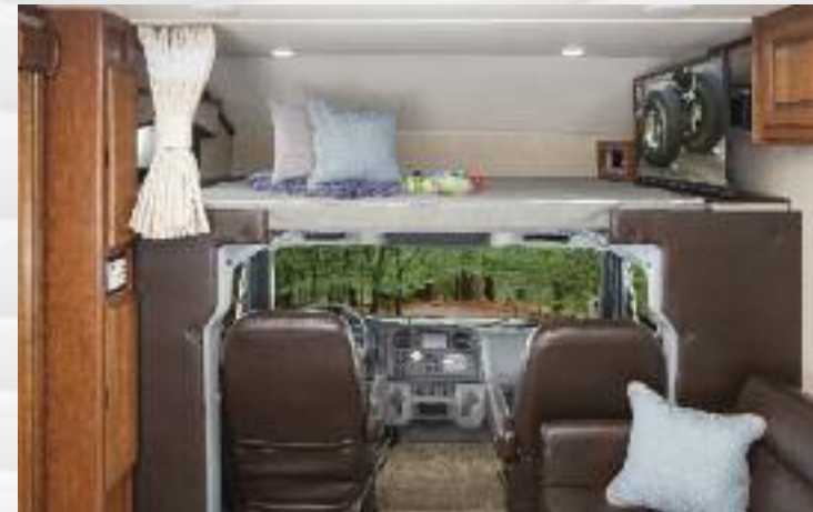
Versatile sleeping and entertainment features include this overcab bunk with a 39" LED TV on a Powered Swing Arm.