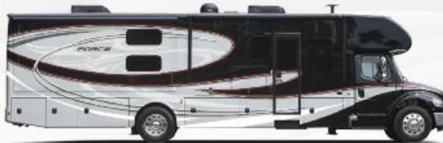
Billet (Force HD – Black Mirage*)

*Force HD includes enhanced full-body paint.