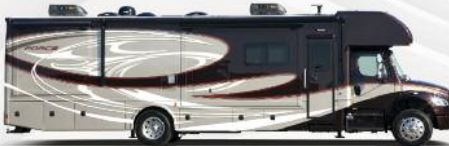
Driftwood (Force HD – Desert Mirage*)