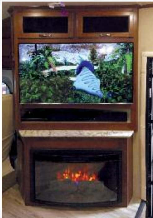
Optional 50" TV with Fireplace (37BH Only)