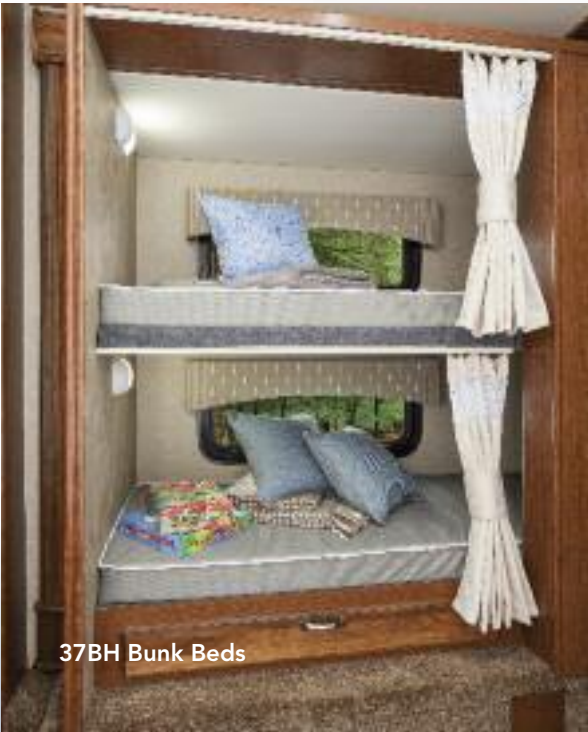
37BH Bunk Beds