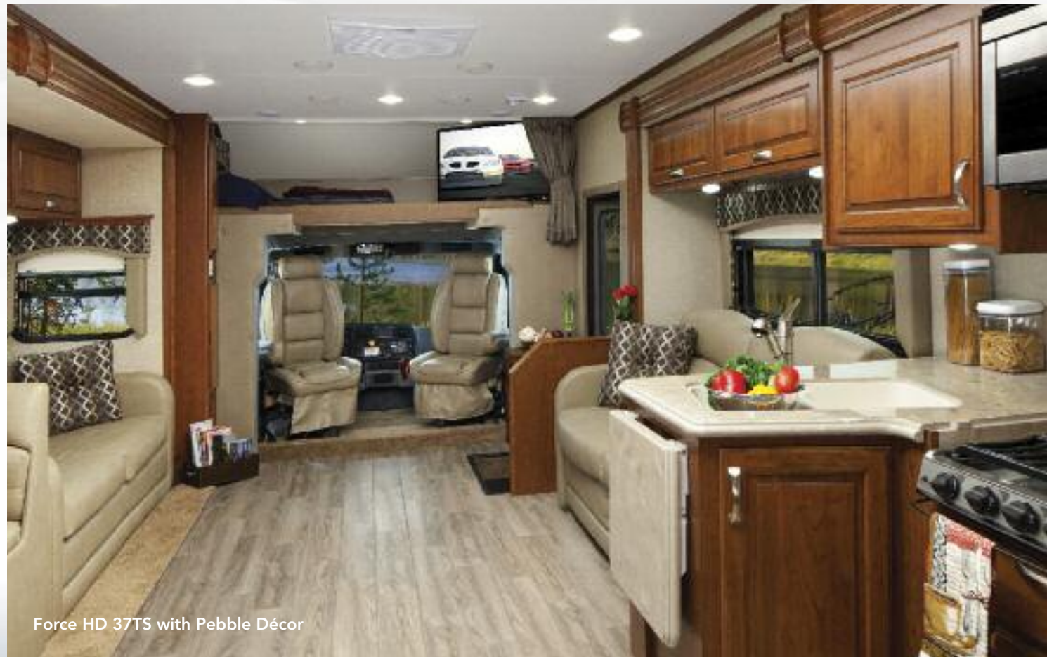
Force HD 37TS with Pebble Décor