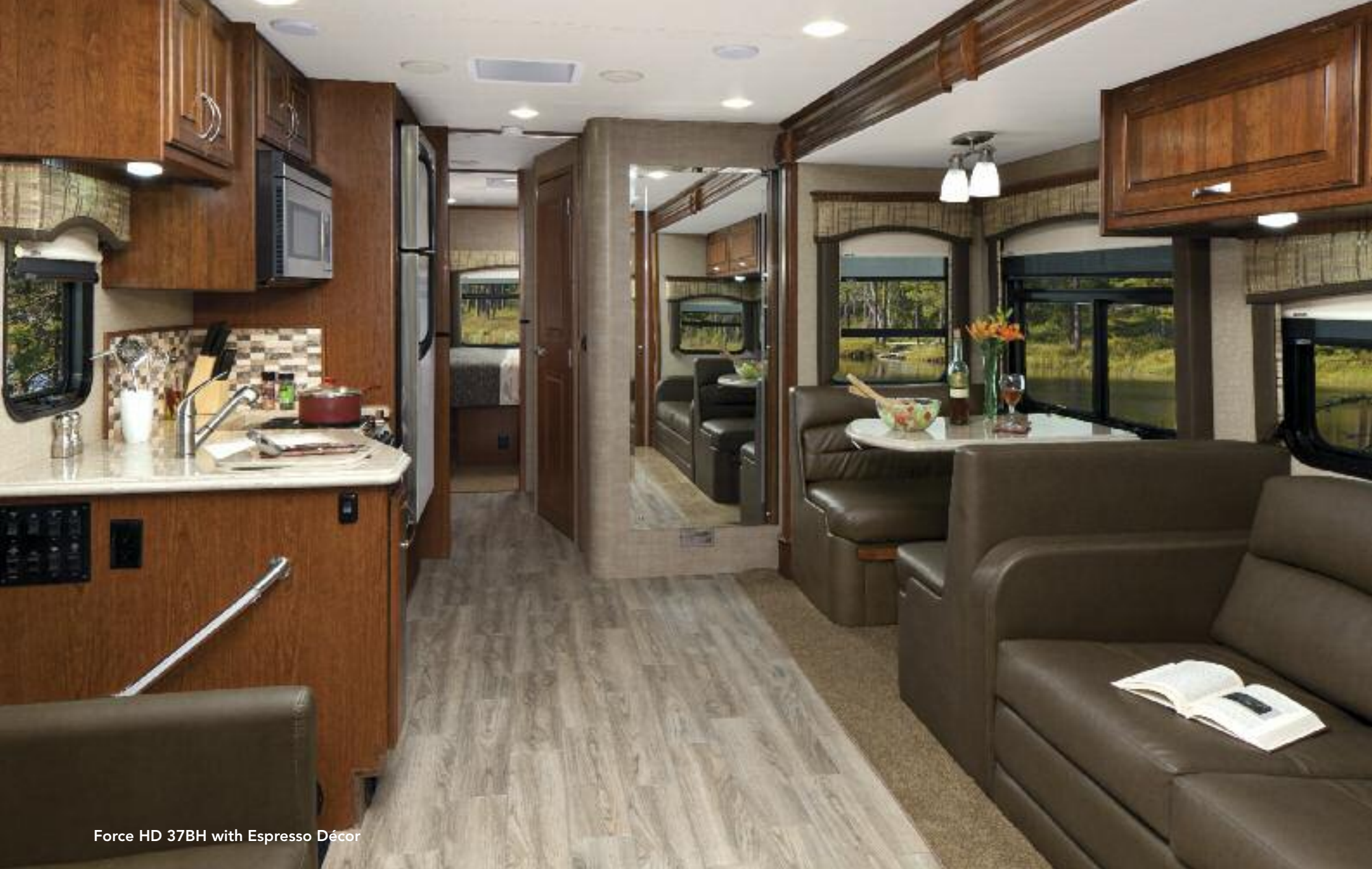
Force HD 37BH with Espresso Décor