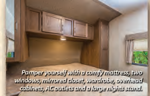
Pamper yourself with a comfy mattress, two windows, mirrored closet, wardrobe, overhead cabinets, AC outlets and a large night stand.

See our newest pictures, floor plans, styles, and features at www.gulfstreamcoach.com