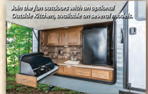
Join the fun outdoors with an optional Outside Kitchen, available on several models.