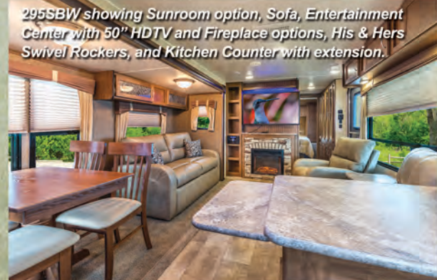
295SBW showing Sunroom option, Sofa, Entertainment Center with 50" HDTV and Fireplace options, His & Hers Swivel Rockers, and Kitchen Counter with extension.