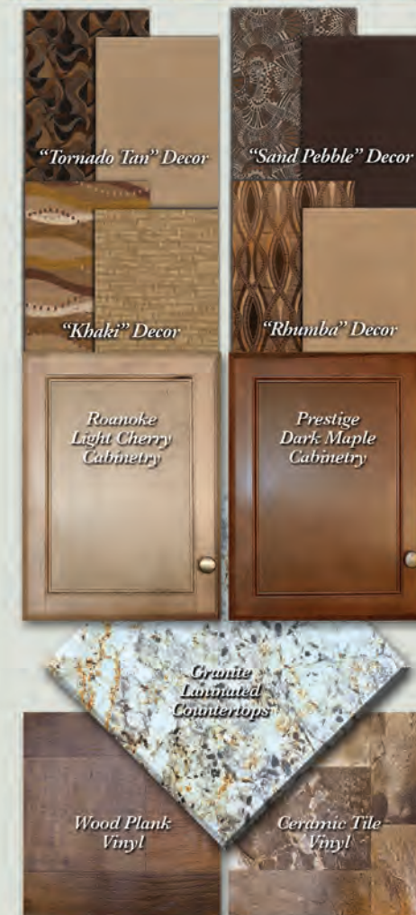
"Tornado Tan" Decor