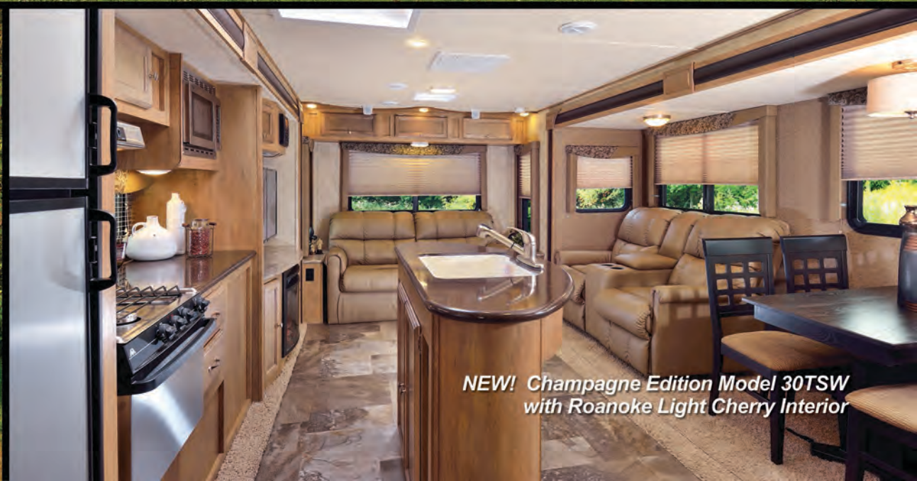
NEW! Champagne Edition Model 30TSW with Roanoke Light Cherry Interior