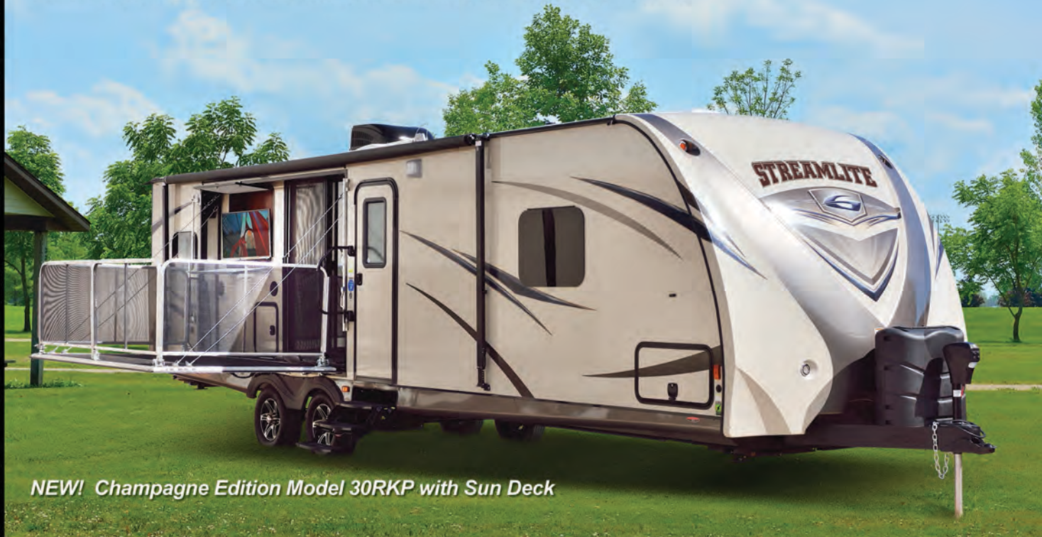
NEW! Champagne Edition Model 30RKP with Sun Deck

The pinnacle of quality, with a distinctive molded gel-coat full fiberglass front cap and a host of innovative enhancements to make life easier and more luxurious.