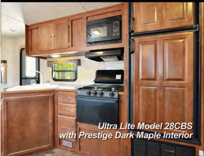
Ultra Lite Model 28CBS with Prestige Dark Maple Interior