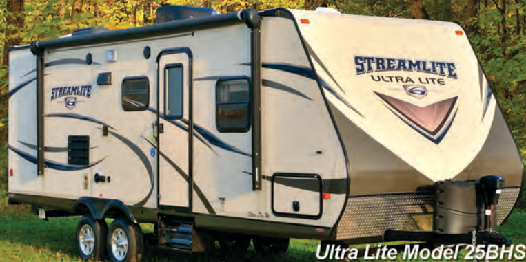
Ultra Lite Model 25BHS

The perfect starting point for years of unforgettable family adventures, Ultra Lites are solid, comfortable, well-equipped and towable by an SUV or Minivan.