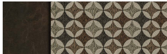
French Roast Décor