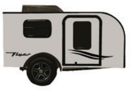
Silver Frost (Metallic)