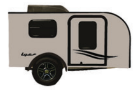
Light Pewter (Metallic)