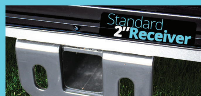
Standard 2" Receiver