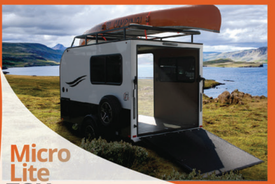
Micro Lite TOY Haulers