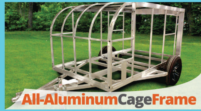
All-Aluminum Cage Frame

The MAX Flyer PLUS allows you to have it all! A micro lite toy hauler with a slideout kitchenette just took the word versatility to a whole new level. Add the optional Tip-Out Bed & Removable Dinette Table and you won't believe the amount of room found in this compact and easy to tow camper.