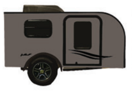
Medium Charcoal Gray (Metallic)