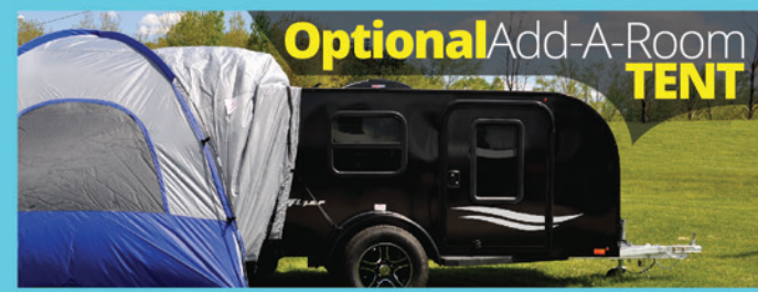
Optional Add-A-Room TENT