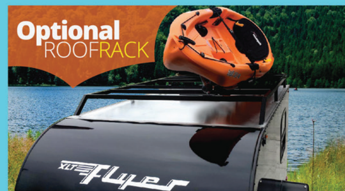
Optional ROOF RACK