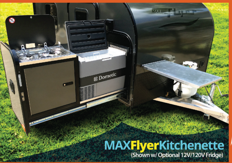
MAX Flyer Kitchenette (Shown w/ Optional 12V/120V Fridge)