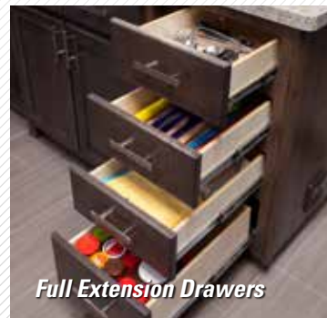
Full Extension Drawers