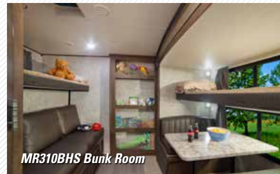
MR310BHS Bunk Room