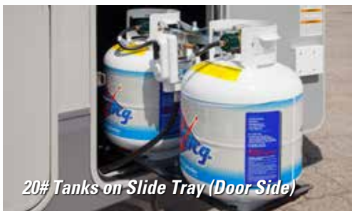
20# Tanks on Slide Tray (Door Side)