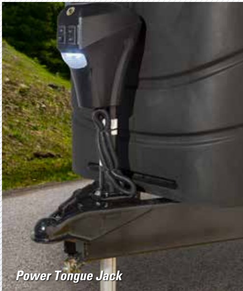
Power Tongue Jack