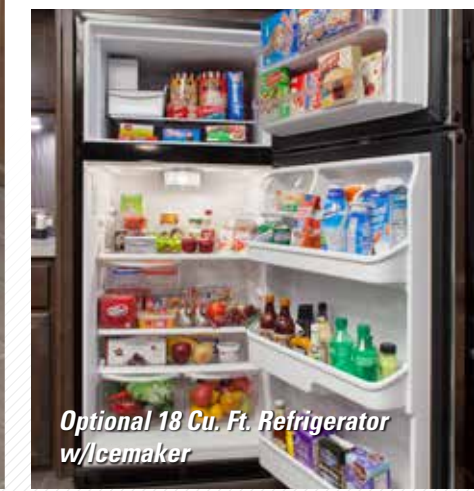
Optional 18 Cu. Ft. Refrigerator w/Icemaker