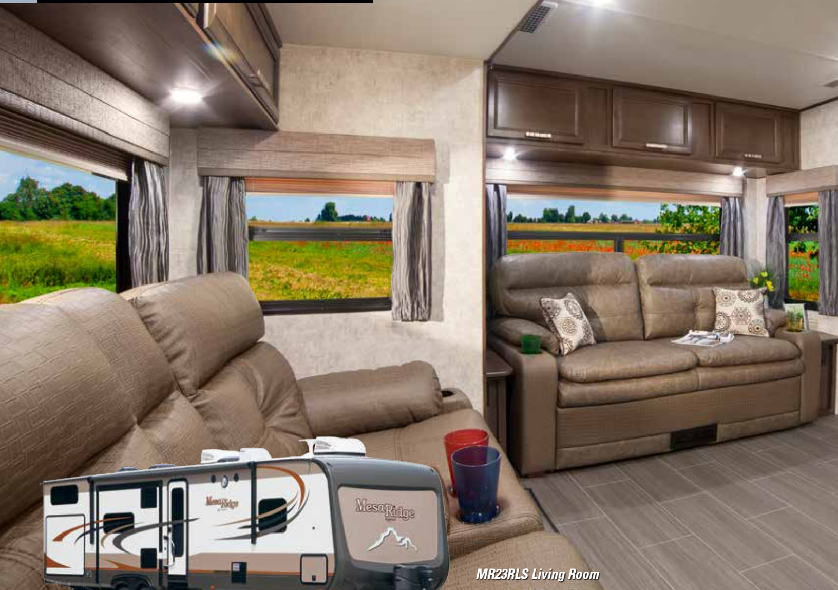
MR23RLS Living Room