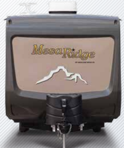
Optional One-Piece Fiberglass Front Cap (N/A RT340FLR)