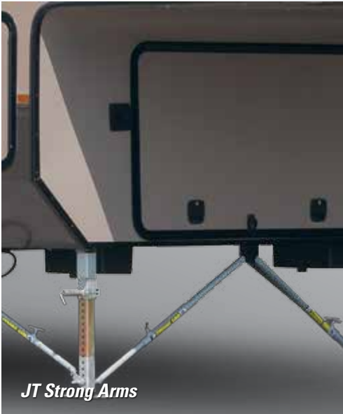
JT Strong Arms