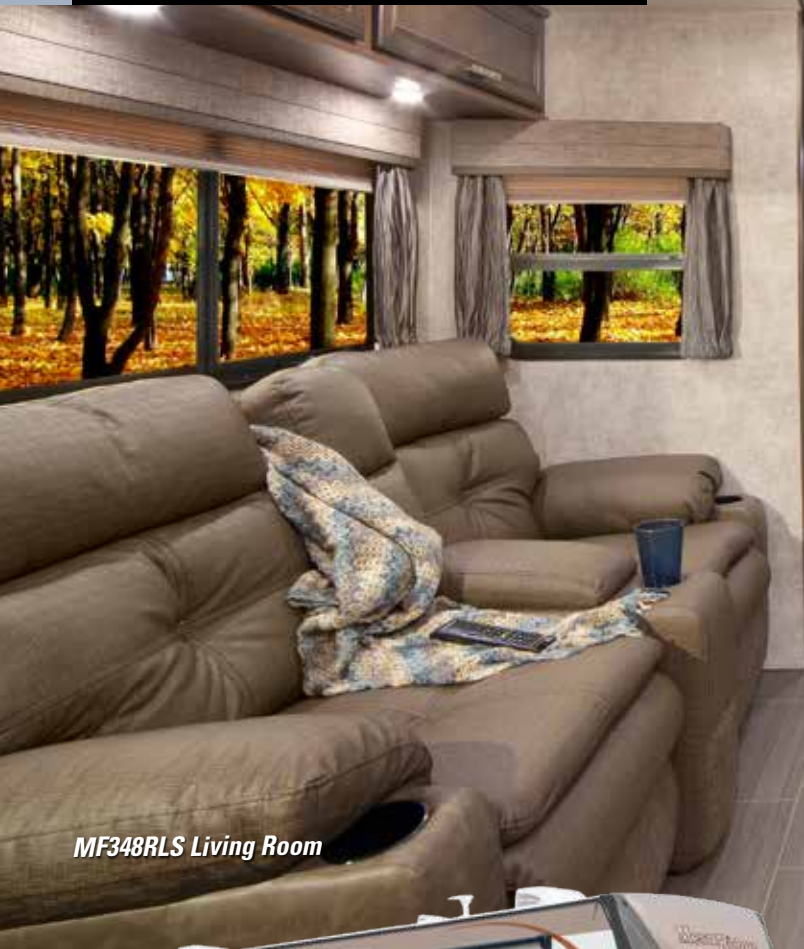
MF348RLS Living Room