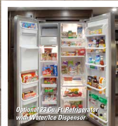
Optional 23 Cu. Ft. Refrigerator with Water/Ice Dispenser