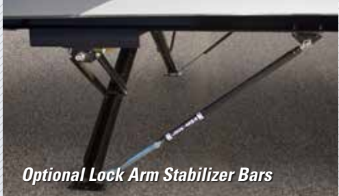
Optional Lock Arm Stabilizer Bars