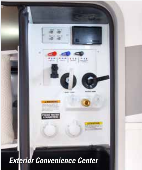
Exterior Convenience Center