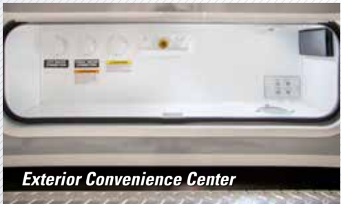
Exterior Convenience Center