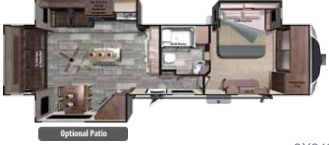
3X349RLS Ext. Length: 37'3" Hitch Weight (lbs): 2,170 Unloaded Wt. (lbs.): 11,330 GVWR: 14,300 Fresh Water (gal): 85 Gray Water (gal): 57 Black Water (gal): 41