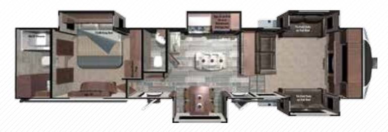
3X387RBS Ext. Length: 41'6" Hitch Weight (lbs): 3,145 Unloaded Wt. (lbs.): 13,320 GVWR: 16,470 Fresh Water (gal): 85 Gray Water (gal): 82 Black Water (gal): 82