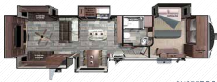
3X375RDS Ext. Length: 42'8" Hitch Weight (lbs): 2,710 Unloaded Wt. (lbs.): 13,110 GVWR: 16,470 Fresh Water (gal): 85 Gray Water (gal): 82 Black Water (gal): 41