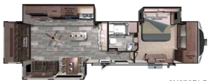
3X378RLS Ext. Length: 40'3" Hitch Weight (lbs): 2,310 Unloaded Wt. (lbs.): 12,180 GVWR: 15,990 Fresh Water (gal): 85 Gray Water (gal): 57 Black Water (gal): 41