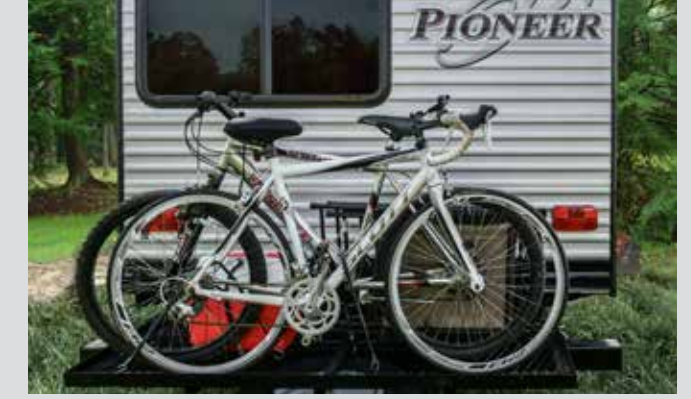
BIKE RACK The built-in, bicycle rack is also great for bulky camping items.