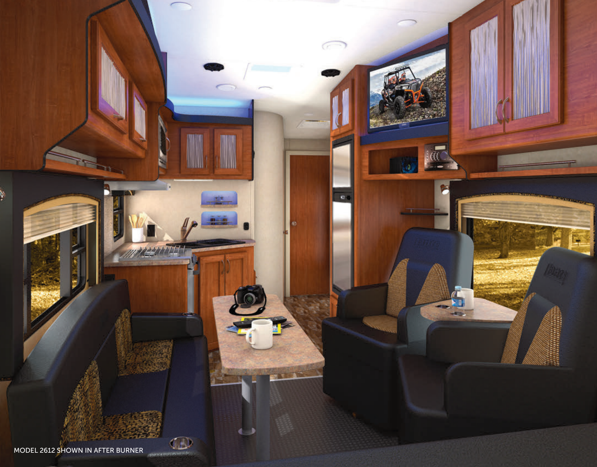
MODEL 2612 SHOWN IN AFTER BURNER