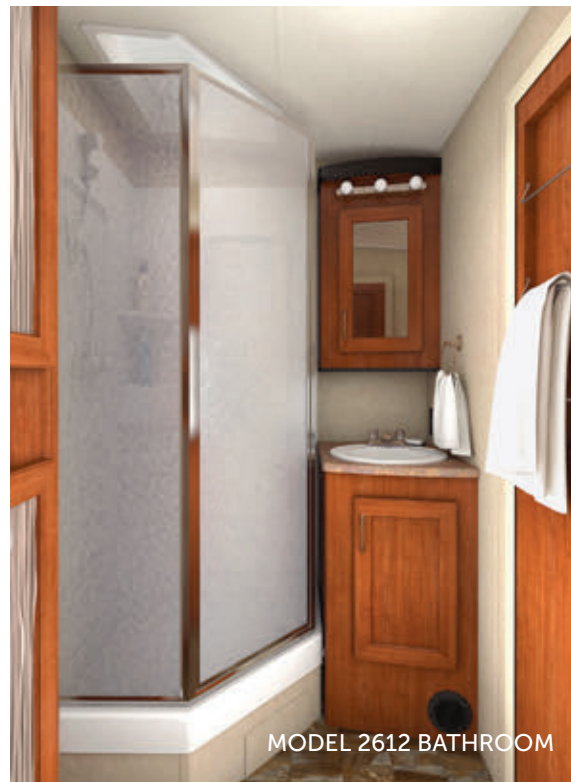
MODEL 2612 BATHROOM