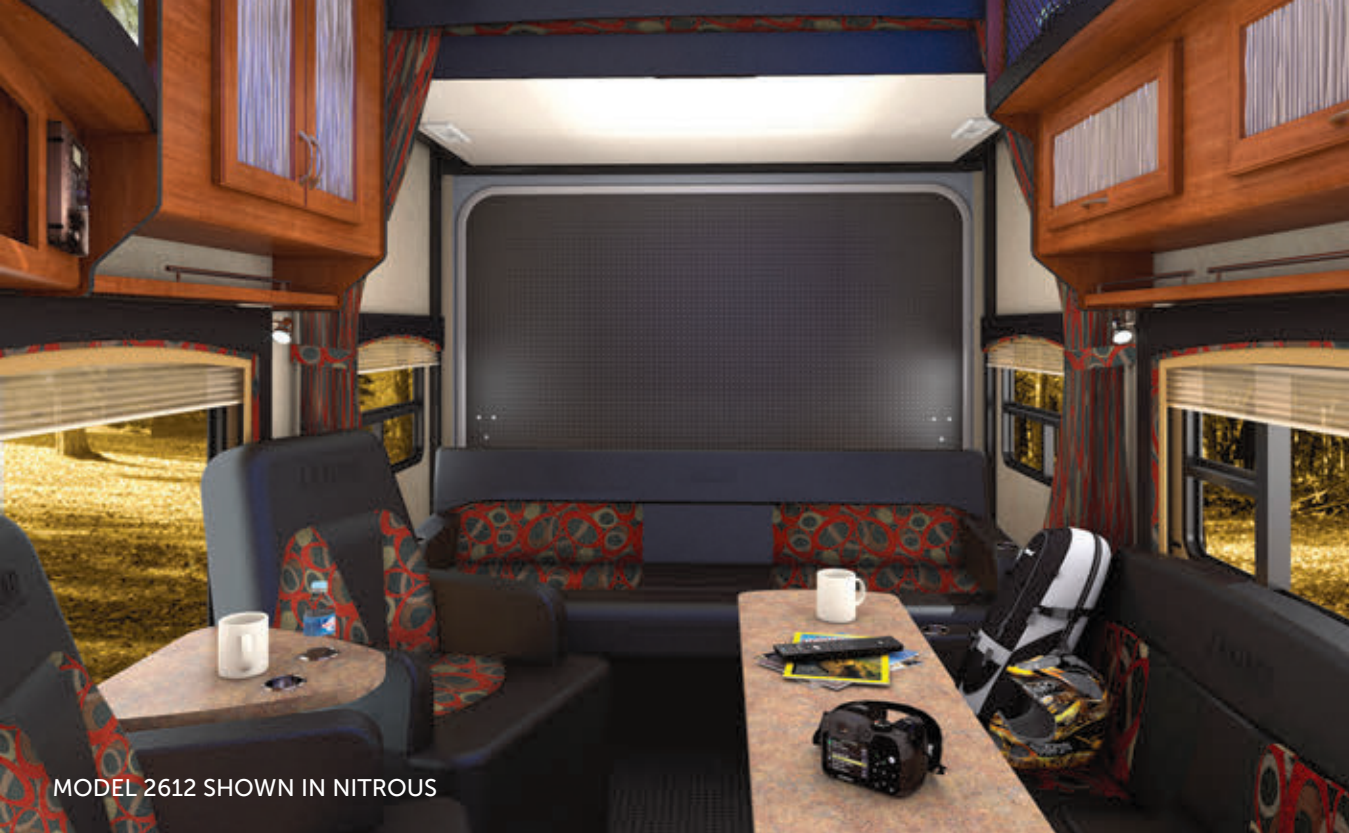
MODEL 2612 SHOWN IN NITROUS