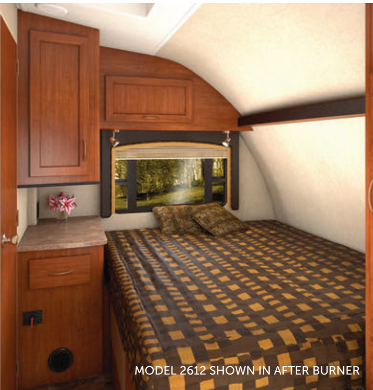
MODEL 2612 SHOWN IN AFTER BURNER

No two Lance owners are alike and neither are our décor packages. Personalize your Lance by selecting from one of our quality interiors, assembled by an interior design team. Featuring stainless steel appliances; beautiful wood cabinetry complete with residential hardware, spacious sinks and optional rugged coin flooring.