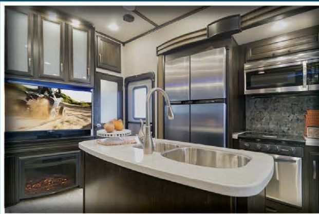
Indulge yourself with stainless steel appliances, solid surface countertops, and hardwood cabinetry. (399TH shown)