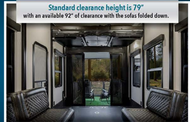
Standard clearance height is 79" with an available 92" of clearance with the sofas folded down.