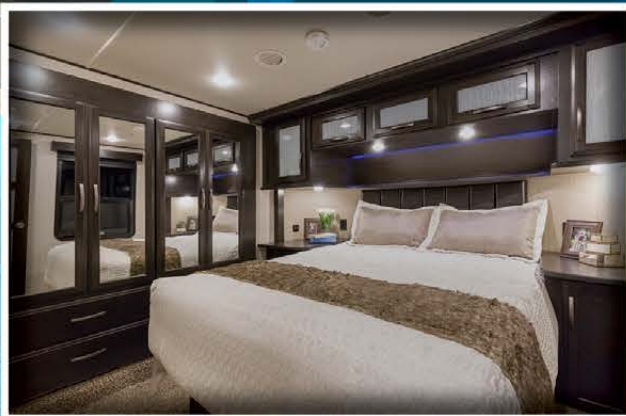
Rest well in the spacious master suite with your choice of a king or queen size bed (most models) and plenty of storage space. (349M shown)