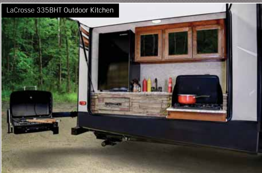
LaCrosse 335BHT Outdoor Kitchen

LaCrosse simply provides a level of luxury that is a cut above.