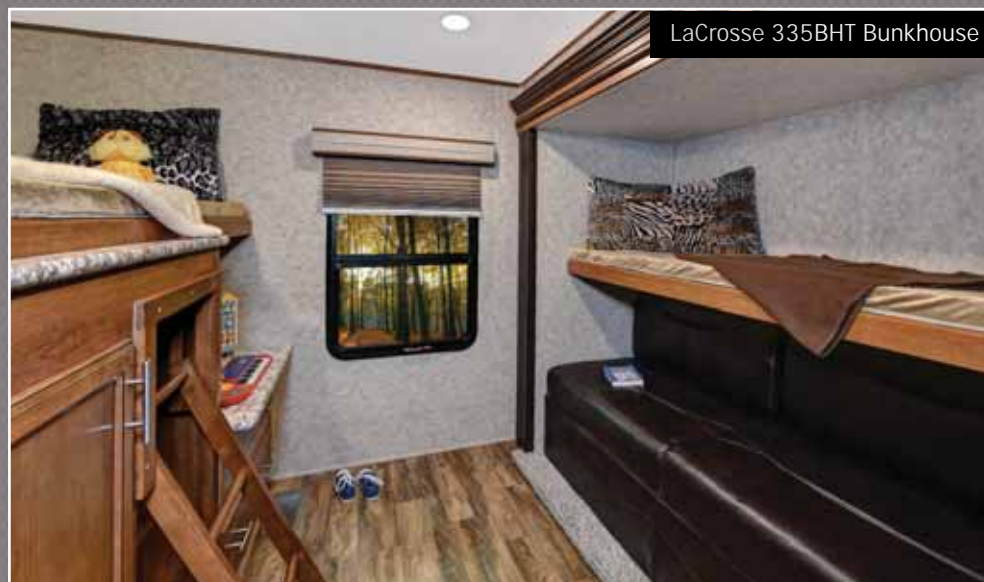
LaCrosse 335BHT Bunkhouse