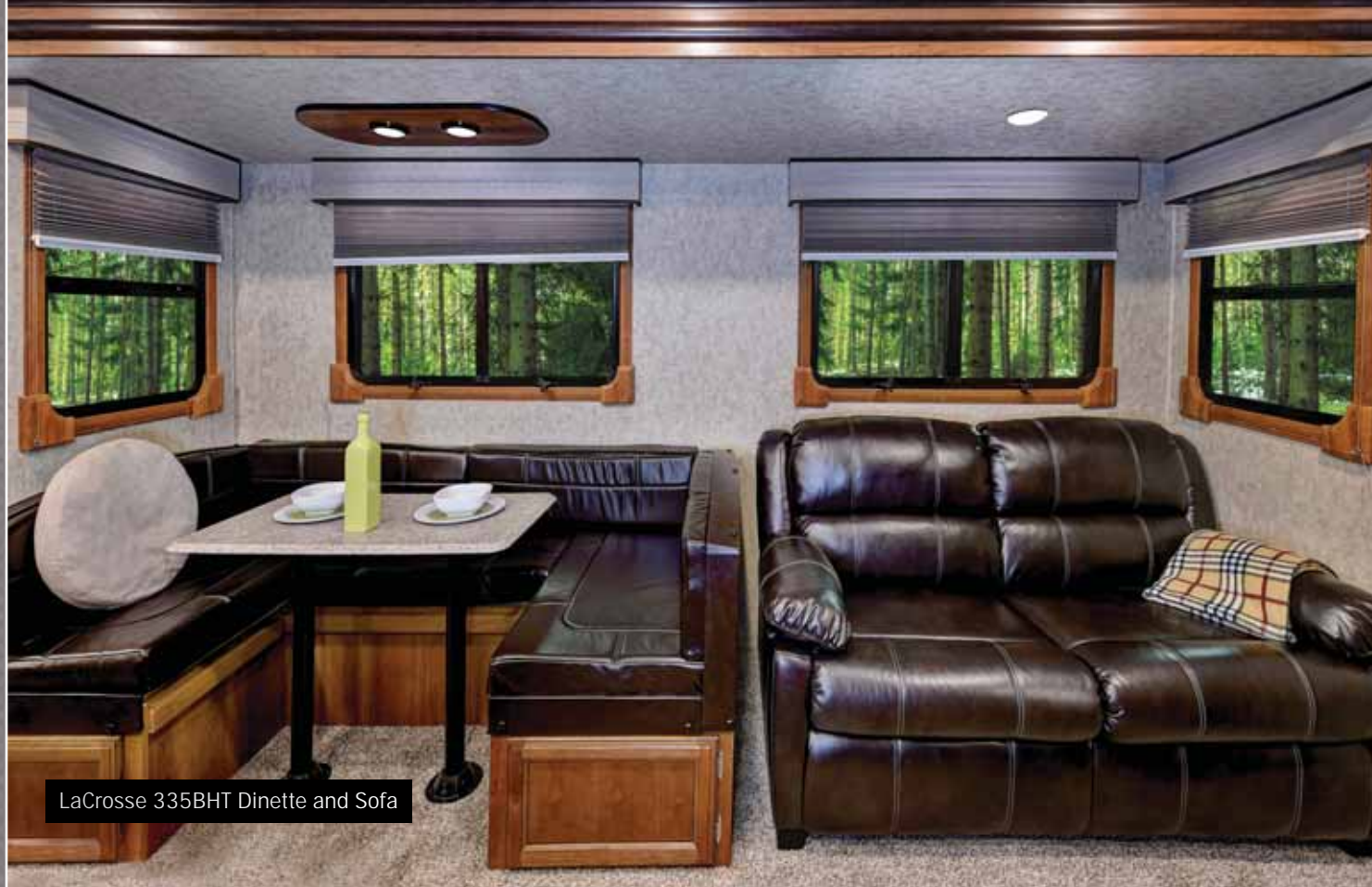
LaCrosse 335BHT Dinette and Sofa

At Prime Time, we know that finding the right floorplan is the single most important decision you make when purchasing your new recreational vehicle. That's why we offer a variety of choices including double and triple slide out floorplans, bunk houses, rear entertainment centers, rear living rooms and rear kitchen models.