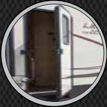
FRICTION HINGE DOOR