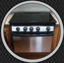
FLUSH MOUNT GLASS TOP RANGE