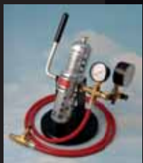
Seek-A-Leak Pressure Test