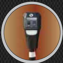
POWER TONGUE JACK