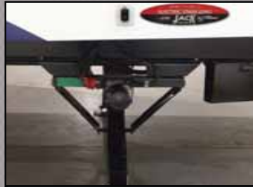
"One Touch" Electric Stabilizer Jacks reduce setup time