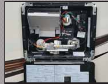
18 Gallon/Hour Quick Recovery Water Heater