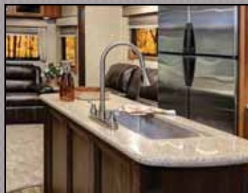
Stainless Steel Sink and Residential Sprayer Faucet