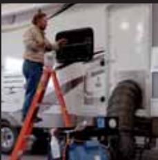
Seal Tech Air Pressure Test

Prime Time Manufacturing is proud to be recognized as an industry leader in value, reliability, and overall quality by the Recreational Vehicle Dealers Association. This was accomplished by committing ourselves to "A Higher Standard" in design, construction, testing, and customer service. Check us out – we know you'll be impressed!