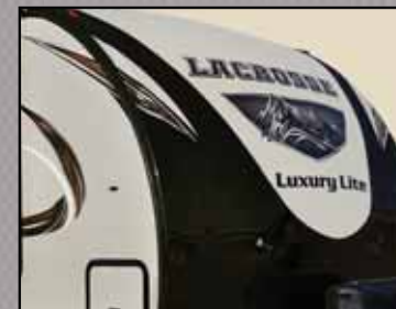
Fiberglass Front Cap improves aerodynamics and fuel efficiency