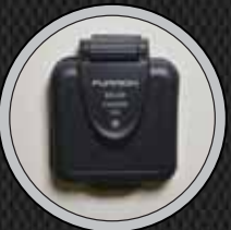
NEW SOLAR PREP