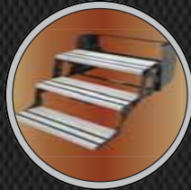
ALUMINUM HYBRID STEPS