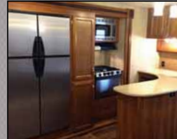
4 Door, 12 Cubic Foot Refrigerator. (Most Models)