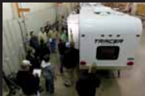
Executive Quality Audits