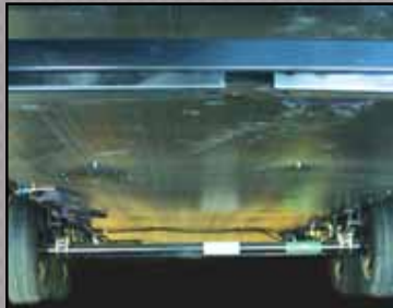
Heated and Enclosed Underbelly extends the camping season