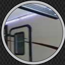
LED LIGHTED AWNING