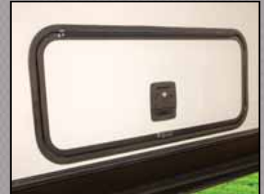
Heavy Duty Slam Baggage Doors