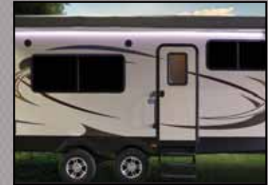
Adjustable "One Touch" Electric Awning