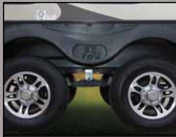
"E-Z" Tow Axles