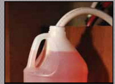
EZ Winterizing Kit is a LaCrosse MAX CONVENIENCE feature