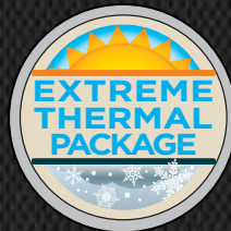
* R-52 EXTREME THERMAL PACKAGE