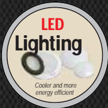
LED INTERIOR LIGHTING