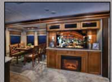
MAX Slide with "Walk In" Ceiling Height and 50 cubic feet of additional living area