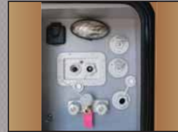
Universal Docking Center with NEW Solar Prep