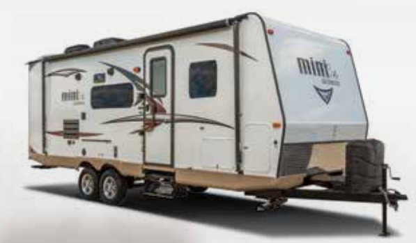
Standard White Exterior

Towing a trailer doesn't require a truck anymore. When towing size and weight are your focus. You will find that these specially designed Mini Lite models offer flexible floor plans that provide you with more comfort and amenities that you would expect all within the towing capacity of many small SUV's and Mini Vans