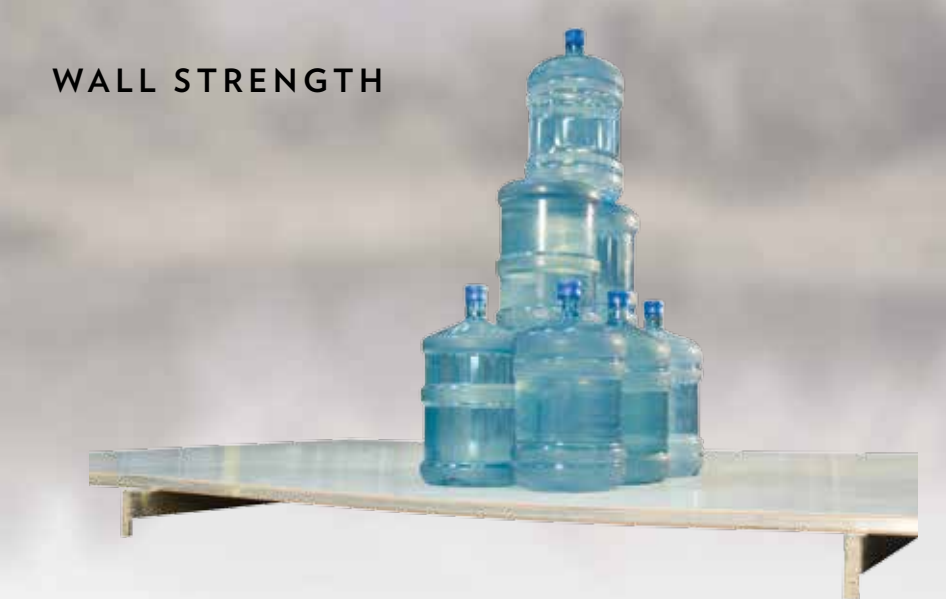
Structurally engineered materials makes our vacuum-bonded walls some of the strongest in the industry.