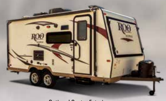
Optional Oyster Exterior

The spacious interiors offer numerous windows, 80" vaulted ceilings with directional vented air conditioning and extensive interior LED lighting throughout. Rich with appointments like solid surface kitchen counter tops and under mount kitchen sinks (select models), a stove top with glass cover, 22" oven and distinctive Maple or Driftwood cabinets with solid wood doors and drawer fronts throughout add to the tremendous value provided.