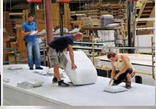
Built strong to enable you to conveniently perform periodic roof maintenance.