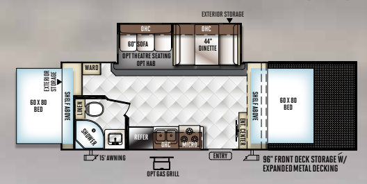
218SL 96" FRONT DECK