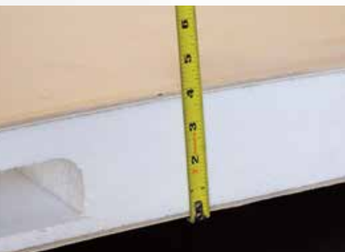
4" thick roof with built in insulated A/C ducts