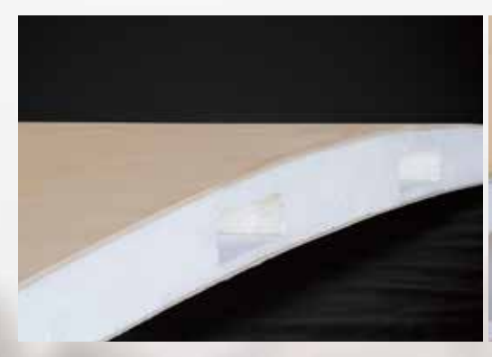
Vacuum-bonded radius roof with vaulted ceiling providing superior insulation and more interior height.