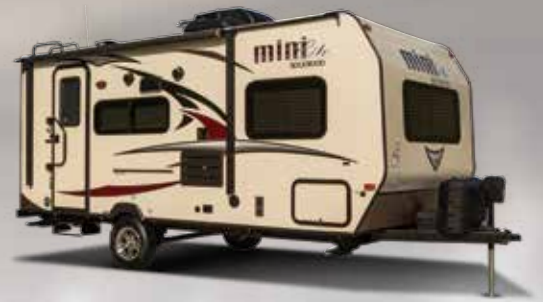
Optional Oyster Exterior

Rockwood travel trailer models are loaded with features like Polished alloy wheels with Nitro filled radial tires mounted to Dexter Torflex Torsion Rubber Ride Axles for a smooth, safe ride, plus that clean Rockwood look with framless bonded windows and an automotive front windshield where applicable.